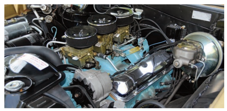
1965 GTO 389 engine with tri-power

On odd years Pontiac always made engineering changes and on even years Pontiac would make styling changes. The engineering improvements heads, a mild cam improvement, and a new intake manifold to work with the heads. The four-barrel engine was rated at 335 horsepower and the tripower engine was now featuring 360 horsepower. Later in the year a cold air package was released and it was available at the dealership. It should also be mentioned that by 1965 many older people were looking at the GTO as the top-of-the-line Le-Mans model, so many of the cars were optioned with all of the creature comforts such as power steering, power brakes, air conditioning, power windows, power seats, and even a power antenna.