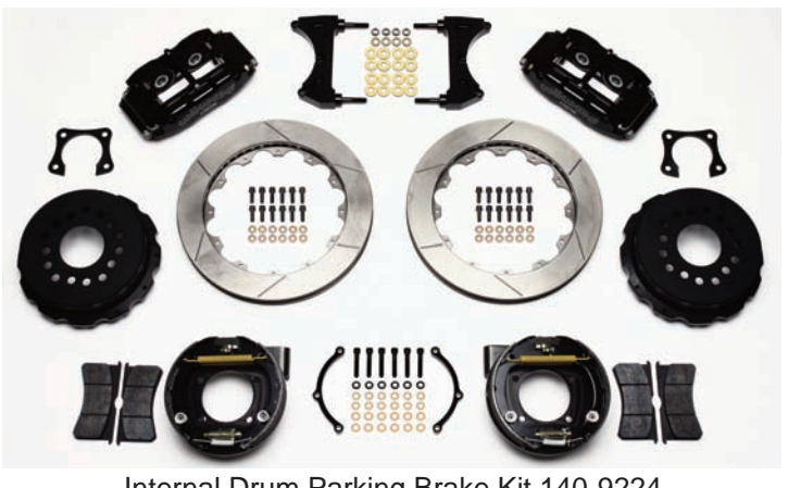
Internal Drum Parking Brake Kit 140-9224

If you want stronger rear brakes, you can install the Superlite 4R Big Brake Rear Parking Brake Kit part number 140-9224. This kit features forged billet Superlite four-piston calipers in a black finish. The calipers work together with 12.88-inch slotted or drilled and slotted rotors that are designed to work with the internal drum parking brake mechanism.