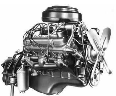
1955 Pontiac Engine

physical stand point, the Pontiac V8 closely resembled the powerful Olds engine. The first Pontiac engine introduced in 1955 was a 287ci engine that delivered 180 horsepower with a two-barrel and