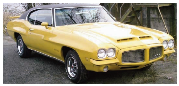
1971 GTO Hardtop

The EPA rules were going into effect in 1971, so all time. This year the car was being offered with a of the Pontiac engines were built with a compres- base 400ci engine delivering 250 horsepower and sion drop. There was also a change in horsepower a 455ci engine that was rated at 300 horsepower. ratings from the old gross ratings to the new net rat- In 1972 GTO sales slipped to 5,807. ings. The 1971 GTO was released and it had a new revised front grille, a new hood with larger scoops and a revised rear bumper. The Judge package was still available and the graphics were just like the '70 model. The big change was under the hood with the new lower compression engines. The 400ci engine compression was lowered to 8.2:1 and the engine was rated at 300 horsepower. The 455ci engine was still being offered and the compression was dropped to 8.4:1. This engine was rated at 325 horsepower and it could only be offered with an automatic transmission. Pontiac was playing games with the horsepower ratings because the gross ratings on this engine would be closer to 400 horsepower. Motor Trend proved that when they tested a 455 GTO with 3.90:1 rear gears and it turned a 13.4 second guarter mile time at 102 miles per hour. The Judge was available again this year but only 374 were built including 17 convertibles. The 455ci engine powered all of the Judges. Total GTO sales for the year was 10,532.