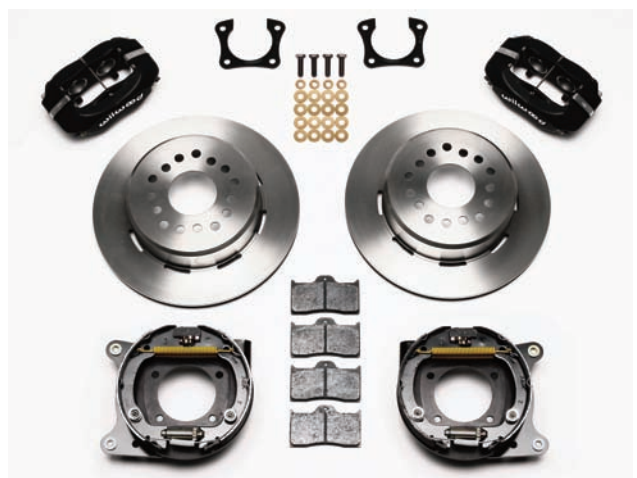
Internal Drum Parking Brake Kit 140-7147

If you want stronger rear brakes, you can install the Superlite 4R Big Brake Rear Parking Brake Kit part number 140-9224. This kit features forged billet Superlite four-piston calipers in a black finish. The calipers work together with 12.88-inch slotted or drilled and slotted rotors that are designed to work with the internal drum parking brake mechanism.