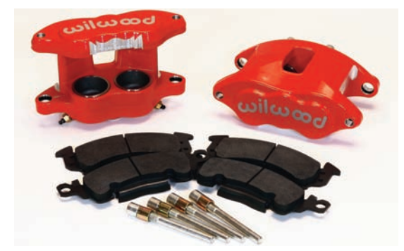
Wilwood D52 Calipers

It was only natural for Wilwood to release a variety of brake improvement kits for the early Pontiac muscle cars. The GTO chassis was essentially the same from 1964 to 1972 so several brake kits were made that fit all of those cars. The Firebird shared the same spindles as the GTO from 1967 to 1969 so they could also use the new brake kits. Pontiac offered disc brakes in 1967 but the first caliper was nothing but trouble. Starting in 1968 the GTOs and Firebirds used a new single piston disc brake so the first upgrade kit that makes sense is the installation of a D52 caliper that offers stronger and more even clamping force on the original rotor. The D52 aluminum caliper is a simple bolt-on operation that can be done in a few hours.