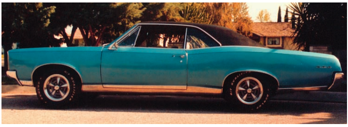
1967 GTO Hardtop

delivering 335 horsepower, an economy version delivering 255 horsepower, an optional high performance engine delivering 360 horsepower with a hotter cam and an open element air cleaner, and a Ram Air version that featured a ram air pan in the trunk for dealer or personal installation. Up until now the automatic transmission was a two-speed, but in 1967 there was a new three-speed automatic transmission, the Turbo 400. If a console was ordered, shifting was handled by a new Hurst His-Hers shifter that allowed manual shifting or full automatic. This was also the first year for front disc brakes, but there were problems with them. Many other muscle cars were being offered in 1967 including the new Firebird, so GTO sales dropped to 81,722 units.