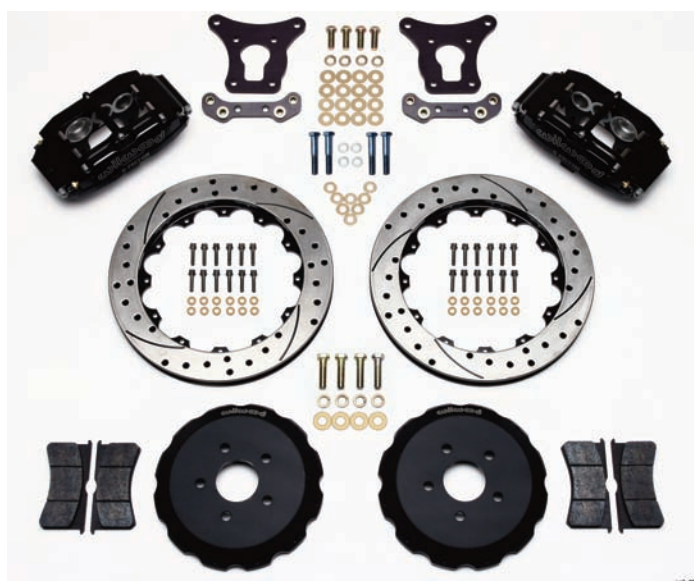
Front Brakes Kit 140-6743-D

When the 1993 Firebird was released, it had horsepower and quarter mile times comparable to many of the '60s Firebirds and GTO models, so performance was back and the buyers were pleased. In 1982 enthusiasts became interested in cars that handled well and that enthusiasm carried through to 1993, so with the new powerful engine, the Trans Am and Formula enthusiasts had cars that could be enjoyed on the street and track. The enthusiasts who were driving their car on the track quickly learned that a brake improvement could increase their lap times, so Wilwood came out with a new brake upgrade kit that was perfect for the new Firebirds. The kit they came out with fits the 1993 to 1997 Firebirds and the front kit is the Superlite 6 Big Brake Front Brake Kit part number 140-6743. This kit features forged billet aluminum Superlite six-piston calipers in a black finish. The calipers work with 12.19-inch rotors in a slotted