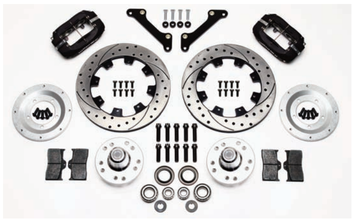
Front Brake Kit 140-9053-D

If your car is running 15-inch wheels you can upgrade to the Forged Dynalite Big Brake Front Brake Kit part number 140-9053. This kit features forged billet aluminum Dynalite four-piston calipers in Platinum-E finish. The caliper is used with the 12.19-inch rotors in a standard or drilled and slotted style.