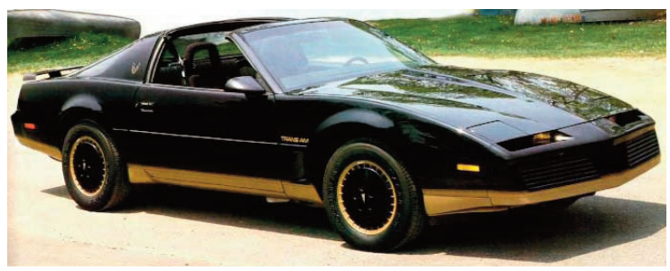
1982 Pontiac Trans Am

The third generation Trans Am was a big departure from the previous car, when Pontiac released a smaller, lighter body style and paltry engine choices. After the second generation Trans Am ended with the wild graphics package and hood birds, the new Firebird was not graphically or esthetically exciting. The body design in general wasn't bad but it needed some embellishments to make it really look nice, and the designers started realizing that and made those improvements as time went on.