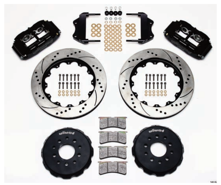
Rear Brake Kit For OE Parking Brake 140-8754-D

Wilwood Engineering 4700 Calle Bolero Camarillo, CA 03012 (805) 388-1188 www.wilwood.com