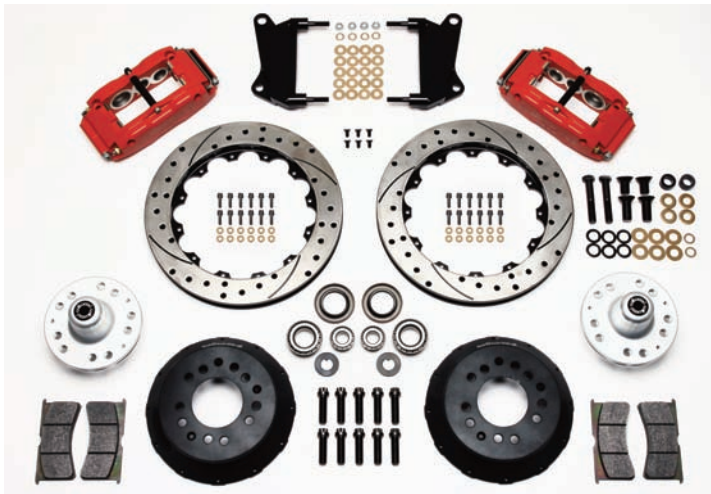
Front Brake Kit 140-9803-DR

Another outstanding improvement is the Superlite 6R Big Brake Front Brake Kit part number 140-9803. The kit features forged billet aluminum Superlite six-piston calipers in a red or black finish or polished for a show car appearance. The calipers work with 12.88-inch rotors in a slotted or drilled and slotted style.