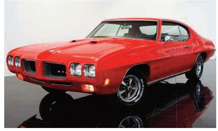
1970 Pontiac GTO

1970 was the last really good year for the auto industry before the EPA rules went into effect, so they went out with a bang. General Motors pulled out all of the stops so that the divisions could produce cars with larger displacement engines. Pontiac was coming out with a totally new Firebird and the GTO got a facelift even though the chassis remained the same. The GTO body design was nice and the Judge was carried over from 1969 with a new graphics package. The engine selections were also opened up to include the standard 400 engine, the Ram Air III rated at 366 horsepower and the Ram Air IV engine rated at 370 horsepower. This year there was another optional 455 engine that was under rated at 360 horsepower. The GTO was better than ever in 1970, but sales dropped to 40,149 units. Pontiac sold 3,797 Judge hardtops and 162