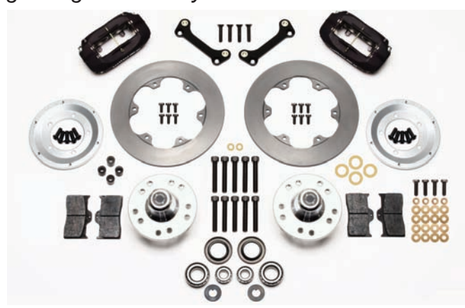
Front Brake Kit 140-1035-B

Brake Front Brake Kit part number 140-11275. This system features forged billet aluminum Dynalite calipers in a black anodized finish. The calipers work with 12.19-inch rotors in a standard or drilled and slotted style. Drag racers will be happy to know that Wilwood also makes a very lightweight kit for the '82 to '92 Firebirds. The Forged Dynalite Front Drag Brake Kit part number 140-1035-B is much lighter than the original brake system. The kit features forged billet aluminum Dynalite four-piston calipers in a black anodized finish. The calipers work with 10.75-inch lightweight rotors that are available standard or a lightweight drilled style.