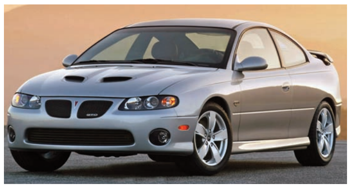
2005 Pontiac GTO

the model year was the Hurst shifter for the six- sold after they drove one. Many GTO buffs thought the car should be more aggressive looking so the following year the car was given two hood scoops and a mild ground effects package. The cars handled so well that many GTOs were purchased forroad racing events. In 2005 the more aggressive looking GTO was also more powerful because it was outfitted with a new LS2 engine delivering 400 horsepower. The GTO could be purchased with a Tremec six-speed or a 4L60E automatic overdrive transmission. The only problem the GTO faced was the high price tag and the faltering economy. Like we mentioned earlier, Pontiac was on the bubble in the '50s but through excellent managers and beautiful performance cars, the brand lasted until the recent General Motors Reorganization. After the reorganization Chevy, Buick and Cadillac remained. This is change we didn't need.