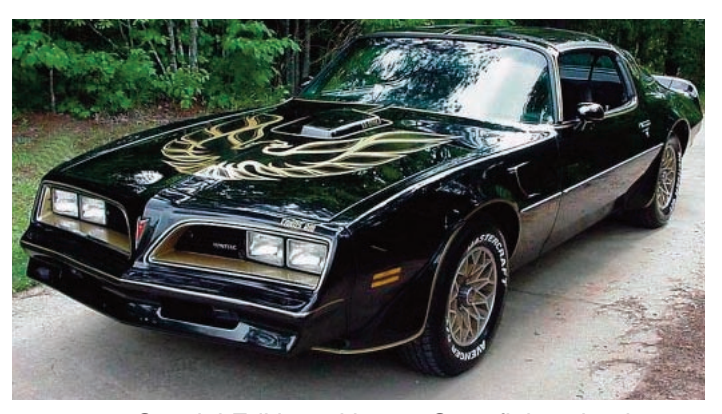
1977 Special Edition with new Snowflake wheels

a 185 horsepower 403ci Olds engine was used and four-speeds were banned, so all of the Trans Ams were automatics. Fortunately the Olds engine was a strong runner, so the Trans Ams were still fun to drive with the engine change. Two Chevy engines were also added to the Firebird lineup in order to meet emissions. Governor Brown was very good at making things difficult by having stricter emissions laws in California than the already repressive Federal restrictions. Even with all of the engine limitations in California, Pontiac was still able to sell 68,745 Trans Ams.