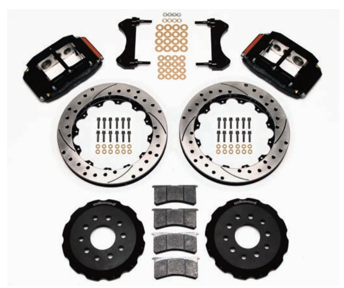
Front Brake Kit 140-7763-D

piston calipers with Thermlock pistons and a black If you like racing in a straight line, Wilwood offers finish. The calipers work with 12.10-inch directional the Dynapro Radial Front Drag Brake Kit part vane, slotted rotors. The kit features high friction number 140-10786. This kit features forged billet brake pads and it comes with braided steel brake aluminum Dynapro four-piston calipers in a black lines.