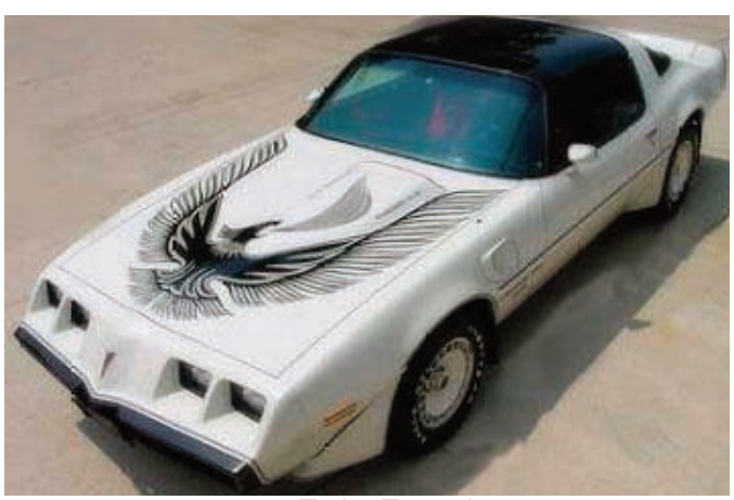
1981 Turbo Trans Am

In 1981 the 301 Turbo engine was allowed into California along with the other smaller engines. The Pace Car Special Edition was also available but this time the car was the official NASCAR pace car. The graphics remained essentially the same except for the door graphics that people seldom installed. If you didn't want a Turbo engine the Trans Am could be ordered with a 150 horsepower 301ci engine or a 145 horsepower 305 Chevy engine. Sales for the last year of any car model tends to decrease because people are anticipating the new model that is coming, so Trans Am sales dropped to 33,493 units. The second generation Firebird was an experiment because prior to 1970 Pontiac changed body styles every two years. This body style ran a full twelve years with only minor changes and improvements and it still looked good when the 1982 Firebird was released.