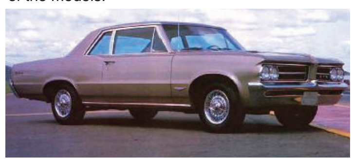
1964 GTO Coupe

In 1963, Pontiac released a new body style that was very attractive, especially the new Grand Prix. The strong street engine options remained the same, but GM management banned racing across the board, so few factory-backed racecars were made. Street performance wasn't banned so Pontiacs remained popular with performance enthusiasts. Most of the Pontiacs were equipped with 389 engines, but an optional 421 was available in some of the models.