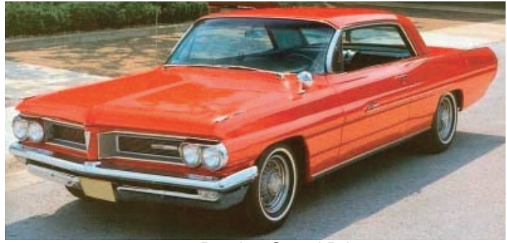
1962 Pontiac Grand Prix

In 1961, Pontiac introduced a clean new body style and the lightest Pontiac was the Catalina. Many racers were interested in the car when they found out that a new 421ci engine with dual-quads could be dealer installed. Several of these cars were built for Super Stock drag racing and they were extremely competitive in the class.