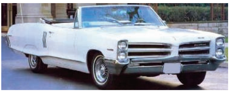
1966 Pontiac 2+2 with 421 Engine

mid-'60s but we should also mention that the big regular driving and a huge secondary side for per-Pontiacs were also offered with some strong engine formance use. The Quadrajet's fuel flow was about options. One of the performance models was the the same as the tri-power, so the full throttle effect 2+2 Catalina that was offered with two powerful 421 was similar without three carburetors. engines a four-barrel version and a tri-power version. The Grand Prix was still popular with older The 1967 GTO shared the same body as the '66 buyers and it could be ordered with a variety of high with a new grille and tail panel. In 1967 there were horsepower engines including the 421 and the 428. four 400 engines available, the standard engine