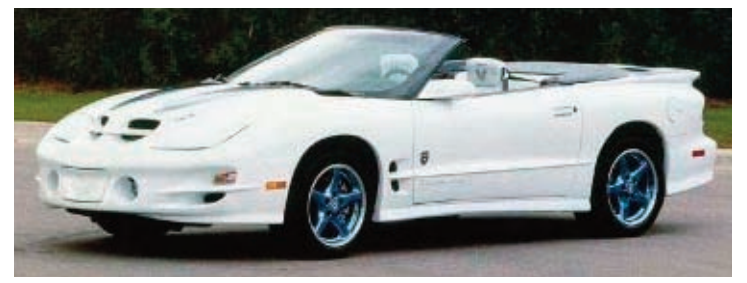
1999 Trans Am 30th Anniversary Special Edition

speed transmission. The Trans Am was also selected to pace the Daytona NASCAR race.