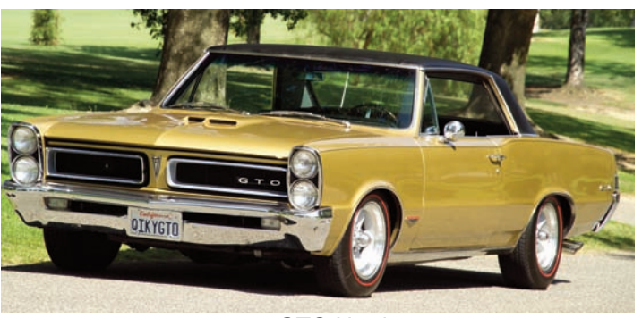
1965 GTO Hardtop

Sometimes small changes can make a big difference and that was certainly the case between the '64 and '65 GTO. Using styling ideas borrowed from the Grand Prix, the '65 GTO featured stacked