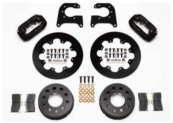
Drag Race Kit 140-7669

systems were different. Pontiac shared the odized finish. The calipers work together with 12.19-Oldsmobile rear axle housing design for an open inch rotors in a standard or drilled and slotted style. driveline system, and it was strong enough to han- and they are used with the internal drum parking