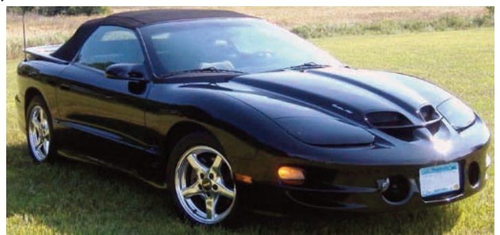
1998 Trans Am

In 1998 the LT1 engine was discontinued and the LS1 all-aluminum engine from the Corvette was used. The new engine featured 305 horsepower in standard form and 320 horsepower with Ram Air. The front fascia was changed and a new domed and scooped hood was added for a more aggressive appearance.