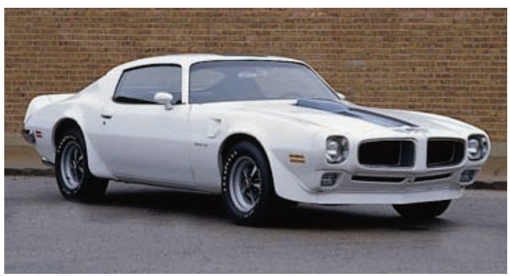
1970 Trans Am

In the middle of the year Pontiac introduced the new 1970 Firebird and the body style was awesome. The body was low and sleek, and it featured a fastback design that even looks fantastic today. Even with the low sales in the first year, the Trans Am models were brought back and that would later prove to be a good idea. The Pontiac stylists finally had some time to work with the car's graphics package and all of the additions they made to the car were actually functional. The car featured a reverse-mounted shaker hood scoop, a rear spoiler, air-deflectors at the front edge of the wheel wells, a front spoiler and a body stripe that ran the full length of the car. This year the Trans Am was available in white with blue stripes or blue with white stripes. The other performance offering was the Formula 400 for enthusiasts who wanted a fast but subtle looking muscle car. Both of the high performance Firebirds were offered with the 335 horsepower H.O. engine with or without Ram Air. There was also a 350ci H.O. engine available that was rated at 320 horsepower. Trans Am sales increased to 3,196 units so it still remained a low production muscle car.