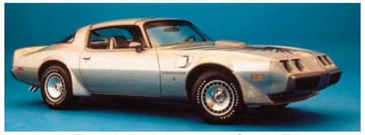
1979 Trans Am 10th Anniversary Special Edition

Trans Am sales dropped drastically in 1980 when the big-block engine was no longer available. In the 49 states, you could get a Pontiac 301 Turbocharged engine that was rated at 200 horsepower, but in California where many Trans Ams were sold, the only engine available was the 145 horsepower 305 Chevy engine. The Turbo engine ran well, so some were brought into California from dealers in other States, but that was on a very limited basis. Some California buyers also went to Arizona, Nevada and Oregon to purchase a Turbo Trans Am, so limiting the sales of the Turbo T/A in California was pointless. The big difference between the Turbo Trans Am and the carbureted version was a hood bulge to clear the turbo on the driver's side