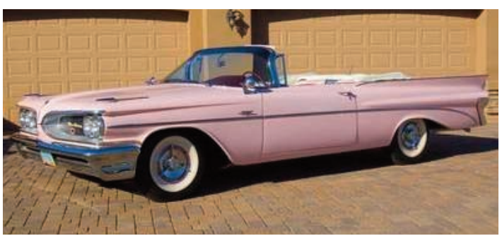
1959 Wide Track Pontiac

The Bonneville name returned in 1958 and it was now available as a two-door hardtop or a convertible. The engine size was increased again to 370 cubic inches and the top model was the fuel-injected version with 310 horsepower. The fuel-injected engine was available, but only 400 were produced. Similar to Chevy, a new body design was released in 1959 that was the first Pontiac with a wide body and because of the new design the car's track had to be increased by five-inches. Milt Coulson, a copywriter at Pontiac's advertising agency, MacManus, John and Adams, created the term "Wide Track". The '59 Pontiac used a minimal amount of chrome and it was the start of the