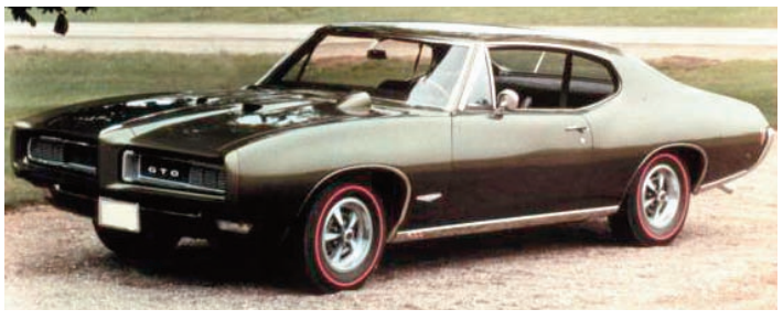
1968 GTO Hardtop

was slight, because everything was optional on the bumper was available for the GTO if people just