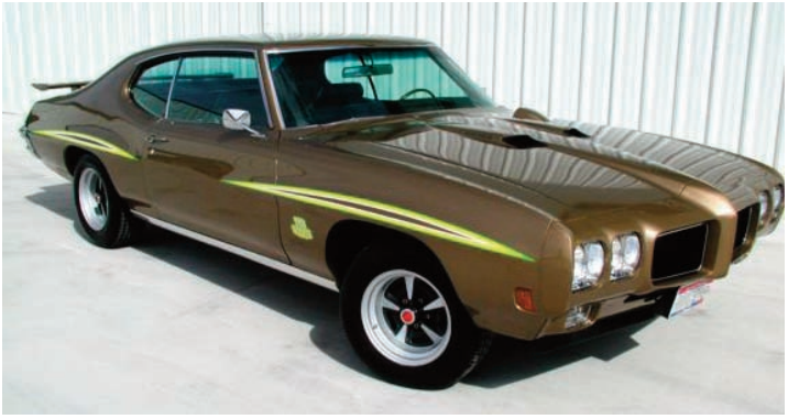
1970 Pontiac Judge

black anodized finish. The calipers are used with all of the performance cars starting in 1969 were a 10.75-inch rotors in a standard or drilled style. All of direct result of the Vietnam War with many potential