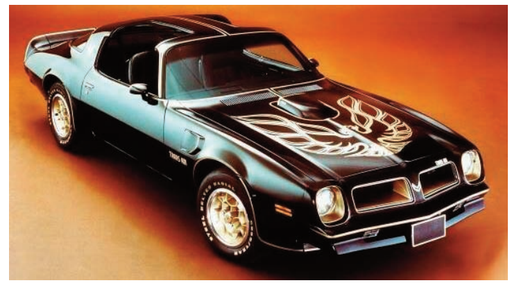
1976 50th Anniversary Special Edition

In 1976 Pontiac changed the front bumper to a nicer more integrated design. Pontiac expanded the color choices for the Trans Am and now the buyer could order them in Cameo White, Firethorn Red, Sterling Silver, Carousel Red, and Goldenrod Yellow. This year was Pontiac's 50th Anniversary so there was a special Anniversary Trans Am that featured a black and gold treatment, an idea that was borrowed from the John Player Special racecar. The black car featured extensive gold pinstriping, a gold hood bird, gold German script lettering, gold honeycomb wheels, a gold engine turned dash panel and a grille accented with gold. The car was absolutely stunning and the public loved it. Pontiac only released 2400 Special Edition Trans Ams and the first 643 were equipped with Hurst hatch roofs and the remaining 1757 didn't have them. The first Hurst hatches had a leaking problem, which was fixed later in the year. Several of the original Special Edition cars were used in the Movie Smokey and the Bandit that was released in 1977 and that movie certainly stimulated sales. The '76 Trans Am was available with a 185 horsepower 400 and it was the last year for the 200 horsepower 455. The Total Trans Am sales for the year was 46,701.