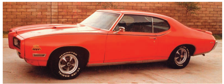
1969 GTO Judge Hardtop Ram Air III

tions, the 366 horsepower Ram Air III engine and the 370 horsepower Ram Air IV engine. The Ram Air IV engine featured new heads with round exhaust ports for better flow, a new aluminum intake manifold topped by an 800cfm Rochester Quadrajet carburetor and it was equipped with a high lift long duration camshaft. Pontiac kept the horsepower figures low because they didn't want to alarm the management but the Ram Air IV engine was delivering over 400 horsepower. In '69 Pontiac sold 77,287 GTOs and of those 6,725 were Judge hardtops and 108 were Judge convertibles.