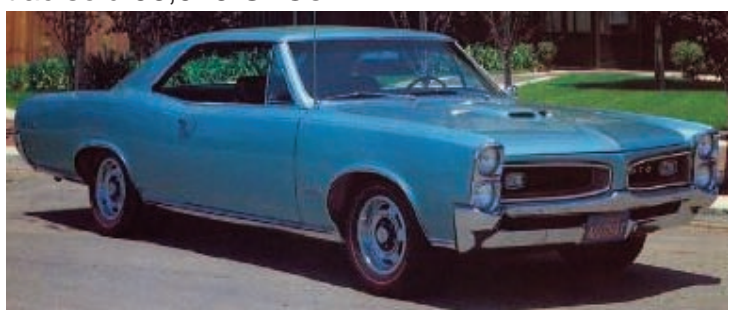
1966 GTO Hardtop

Pontiac made a body change in 1966 and the new GTO was larger than the '65 GTO. Even though the GTO was bigger than the previous model, they had a very pleasing design with the start of the "coke bottle" shape. The roof was rounder and sleeker than the previous model and the rear sail panels flowed back into the rear quarters creating a tunneled rear window. In 1966, the GTO became a separate model, not a LeMans option. The engine selections remained the same but there was a tri-power change because the '66 used a larger center carburetor. The GTO was catching on with enthusiasts and the song probably helped because in 1966 Pontiac sold 96,946 GTOs.