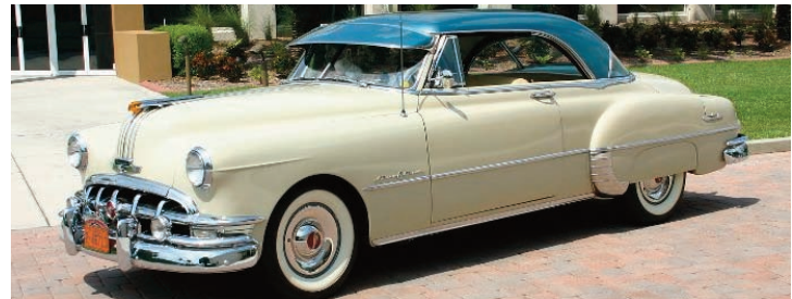
1950 Pontiac Super Deluxe Catalina

cars were always more luxurious with nicer exterior and interior designs.. A good example was the 1950 Pontiac Super Deluxe Catalina that featured hand buffed leather in the interior along with chrome strips in the headliner. The car also featured two-tone paint, a nice feature way back in 1950.