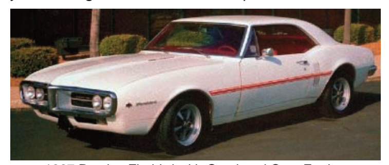
1967 Pontiac Firebird with Overhead Cam Engine

Camaro and the Firebird came standard with many had to have one. of Camaro's optional features. Similar to Ford and Chevy, the Firebird could be ordered with a six-cylinder engine, but not just any six, it was a single overhead cam six-cylinder engine that could be ordered in several power ranges. The top six-cylinder engine was a good performer and it was also impressive when the hood was opened. Most Firebirds were equipped with the 326ci engine and it could be ordered with a two barrel producing 250 horsepower or an H.O. version with a four-barrel carburetor that was delivering 285 horsepower. Performance enthusiasts could order the Firebird with a 325 horsepower 400ci engine that was exactly the same as the higher horsepower GTO engine. The only difference was a carburetor stop that didn't allow the car to have full throttle. Sometimes the salesmen or mechanics at the dealers would tell customers how to remove the stop for more power. Similar to the GTO. the Firebirds could also be ordered with Ram Air and the parts were put in the trunk. The H.O. engine featured a hotter camshaft and free flowing exhaust manifolds. Since the Firebird was lighter than the GTO, the cars offered awesome acceleration when you could get the tires to hook up.