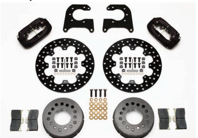
Drag Race Kit 140-7667

dle the power of the new Pontiac engine and the brake mechanism. stronger Olds engine. The differential had a big case, a huge ring and pinion gear, and large strong axles. When race enthusiasts saw this new assembly they knew it would stand up to some very serious horsepower. Before long, the differential was being used in street performance vehicles, as well as competition-only racecars such as the gasser class cars. Wilwood was aware of their racing uses, so they designed a few disc brake kits for the rear differential. One of the kits is the Dynapro Low-Profile Rear Parking Brake Kit part number 140-11397. The kit features forged billet Dynapro four-piston calipers in a black anotized finish. The calipers work together with 11-inch standard or drilled and slotted rotors, and the hub assembly is designed for the internal drum parking brake mechanism. A rear brake kit for racecars is the Forged Dynalite Rear Drag Brake Kit part number 140-7667. The kit features forged Billet Dynalite fourpiston calipers in a black anodized finish. The calipers work with the thin and very lightweight 11.44-inch rotors in a standard or the lighter weight drilled style.