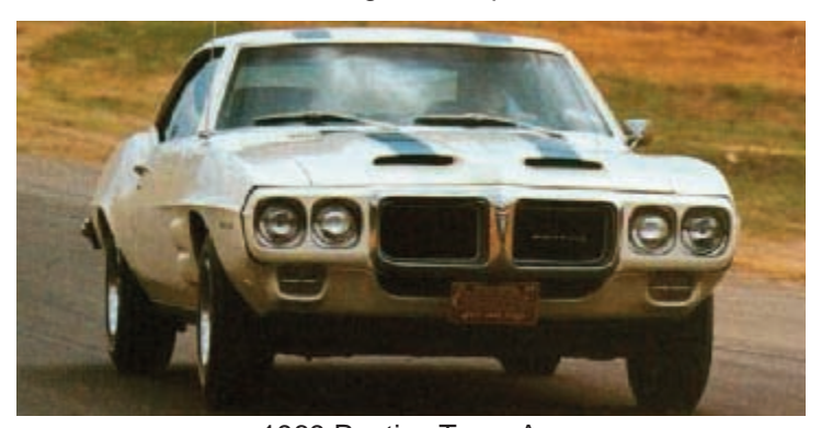
1969 Pontiac Trans Am

The '69 Firebird had a styling change and it was met with mixed reactions. The nose was changed, the smooth body was given body accents and the wheel openings were squared off at the top. The interior was very nice with a new weaved material that provided a rich look. The Firebird 400 was the top model, but the new Trans Am offering replaced it. The Trans Am featured a new hood with two large scoops, a rear spoiler and front quarter scoops. The car was only offered in white with two blue stripes running from the hood scoops back to the rear of the car. The Trans Am was offered with two Ram Air engines, the Ram Air III engine rated at 335 horsepower and the Ram Air IV engine rated at 345 horsepower. Pontiac was playing games with the horsepower ratings because the engines were exactly the same as the ones in the GTO Judge when the throttle stops were removed. In 1969 Pontiac sold 88,405 Firebirds, but of those only 697 were