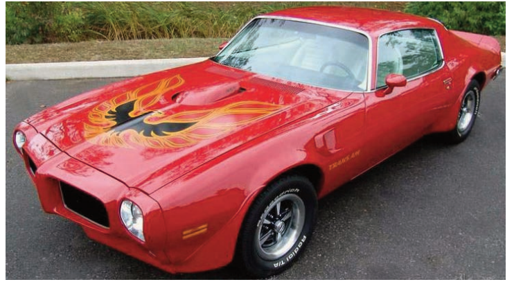
1973 Super Duty Trans Am in Buckaneer Red

The GTO's fate was sealed when it became on option on the Pontiac Ventura body style. The Ventura was basically a Pontiac packaged Nova. By adding $195 you could get the GTO package that consisted of heavy-duty suspension, a Trans Am style hood scoop and a 200 horsepower 350 V8. At least some people liked the new car because Pontiac sold 7,058 GTOs in '74, but that was the last GTO until 2004 so we will get into that later.