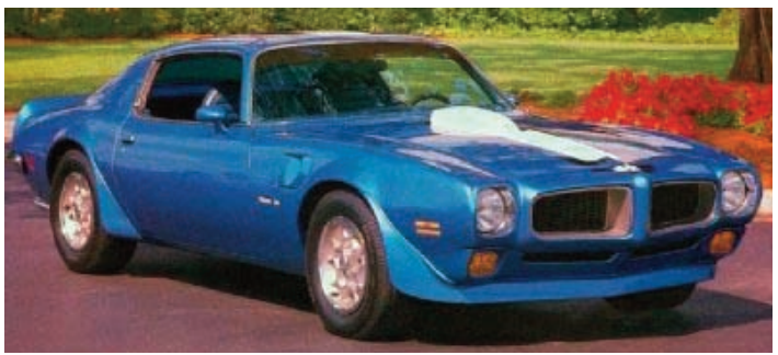
1972 Trans Am With Honecomb Wheels

The 1972 Firebird performance cars weren't doing much better because of the times. To top it off there was a strike going on that certainly limited production of GM cars so Firebird sales were hurt for part of the year. When the Firebirds were back into production they were available with a 160 horsepower 350, a 250 horsepower 400 and a 300 horsepower 455. Pontiac also released a custom wheel upgrade in the form of a Honeycomb wheel. The Trans Am was only offered with the 300 horsepower 455 and only 1,286 were produced.