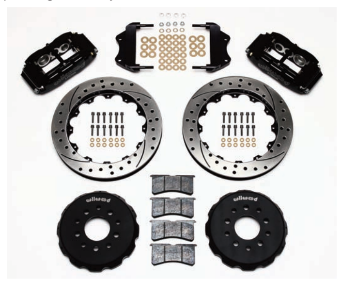
Front Brake Kit 140-8753-D

Brake Kit for OE Parking Brake part number 140-8754. This kit features forged billet aluminum Dynapro four-piston calipers in a black finish. The calipers work perfectly with the 12.19-inch rotors in a slotted or drilled and slotted style. This rear brake kit works perfectly with the OE internal drum parking brake system.