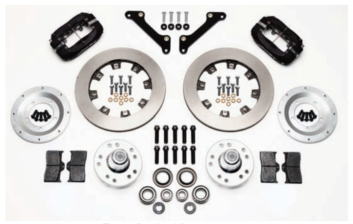
Front Brake Kit 140-8582

A small upgrade is the Forged Dynalite Big Brake Front Brake Kit part number 140-8582. This kit features forged billet aluminum Dynalite four-piston calipers in a black anodized finish. The calipers work with 12.19-inch rotors in a standard or drilled and slotted style.