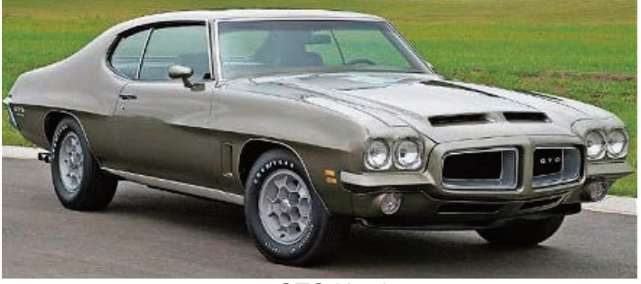
1972 GTO Hardtop

In 1972 the GTO reverted back to an option on the LeMans model and that was due to the lows sales figures the previous year. Pontiac was doing every- both cars were available with the same engine sething they could to stimulate the sales of the GTO, lections, the GTO sales dropped to 4,806 units and but they were fighting the political climate of the Grand Am sales totaled 43,136.