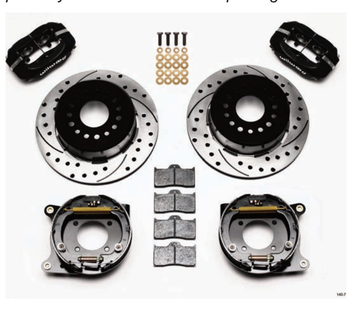
Rear Internal Drum Parking Brake Kit 140-7148

Wilwood also makes a rear brake improvement kit and it is the Dynapro Low-Profile Rear Parking Brake Kit part number 140-11399. This kit features forged billet aluminum Dynapro four-piston calipers in a red or black anodized finish. The calipers work with 11-inch rotors in a standard or drilled and slotted style. This kit works with the internal parking brake system. Wilwood also offers another rear kit. the Forged Dynalite Rear Parking Brake Kit part number 140-7148. This kit features forged billet aluminum Dynalite four-piston calipers in a red or black anodized finish. The calipers work with 12.19-inch rotors in a standard or drilled and slotted style. The rotor hub works perfectly with the internal drum parking brake.