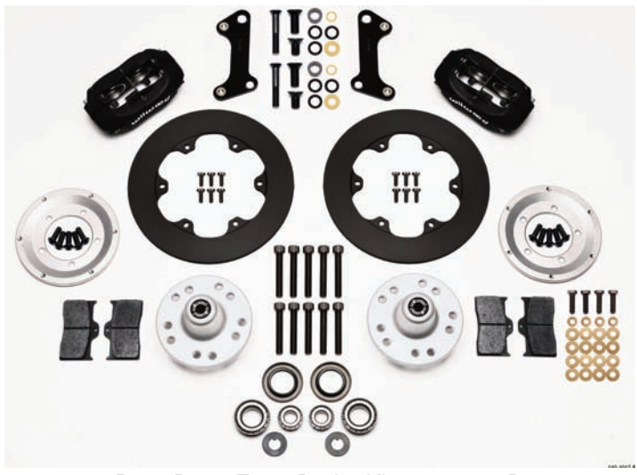
Drag Race Front Brake Kit 140-1017-B

billet aluminum Dynalite four-piston calipers in a Judge convertibles. The dropping sales figures for the kits feature an aluminum hub assembly and are buyers serving in the military. an easy bolt-on operation.