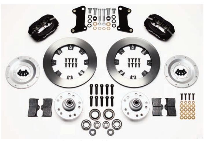
Front Brake Kit 140-7675

One step up is the Forged Dynalite Big Brake Front Brake Kit part number 140-7675. This kit is similar to the previous one, but it features 12.19inch rotors in a standard or drilled and slotted style. This kit works with most 15-inch wheels.