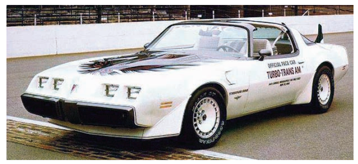
1980 Turbo Trans Am Indy Pacecar

Trans Am sales dropped drastically in 1980 when the big-block engine was no longer available. In the 49 states, you could get a Pontiac 301 Turbocharged engine that was rated at 200 horsepower, but in California where many Trans Ams were sold, the only engine available was the 145 horsepower 305 Chevy engine. The Turbo engine ran well, so some were brought into California from dealers in other States, but that was on a very limited basis. Some California buyers also went to Arizona, Nevada and Oregon to purchase a Turbo Trans Am, so limiting the sales of the Turbo T/A in California was pointless. The big difference between the Turbo Trans Am and the carbureted version was a hood bulge to clear the turbo on the driver's side