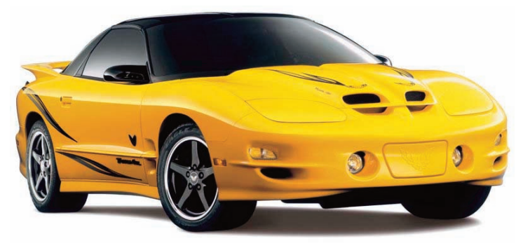
2002 Special Edition35th Anniversry Firebird

The final year for the Firebird was 2002 so Pontiac decided to issue a special 35th Anniversary Firebird. The special model Trans Am featured yellow paint. black wheels and special graphics. The engine selection remained the same with a 310 horsepower LS1 engine and a 325 horsepower WS6/Ram Air engine.