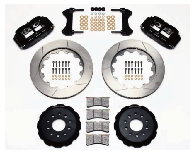
Front Brake Kit 140-9834