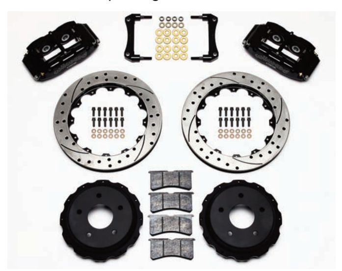
Rear Brake Kit for OE Internal Drum 140-9830-D In 1999 the Trans Am celebrated its 30th Anniversary with a new special edition model that featured a white with blue color scheme. The wheels were also tinted blue. The big change for

Wilwood also offers a rear brake kit, the Superlite 4R Big Brake Rear Brake Kit for OE Parking Brake part number 140-9830. This kit features forged billet aluminum Superlite four-piston calipers a red or black finish. The calipers work with the 12.88-inch rotors in a slotted or drilled and slotted style. The rotors work perfectly with the OE internal parking brake mechanism.