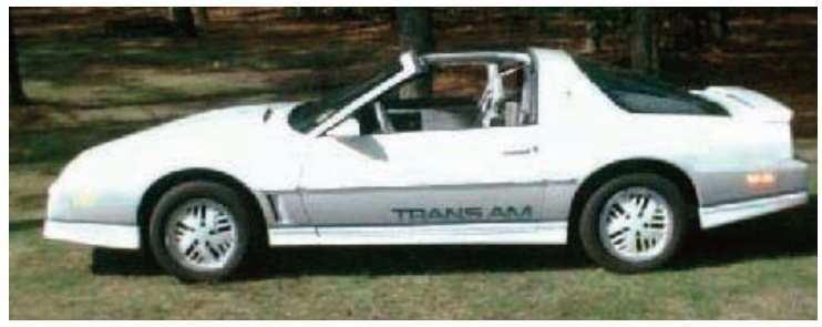
1984 15th Anniversary Trans Am

In 1984 Pontiac recognized the 15th anniversary of available and it was rated at 205 horsepower. Two the Trans Am and they released a special edition white and blue model powered by the L69 engine backed by a five-speed transmission. Pontiac also made a big improvement when the wheels were restyled to a finned design. The first dish-covered wheels were designed to give the new Firebird the lowest drag coefficient of any car and they succeeded with a 0.335. The special edition model was delivered with 16-inch wheels running "Gatorback" tires. The Anniversary edition and the L69 engine stimulated sales so Pontiac sold 55,374 Trans Am Firebirds.