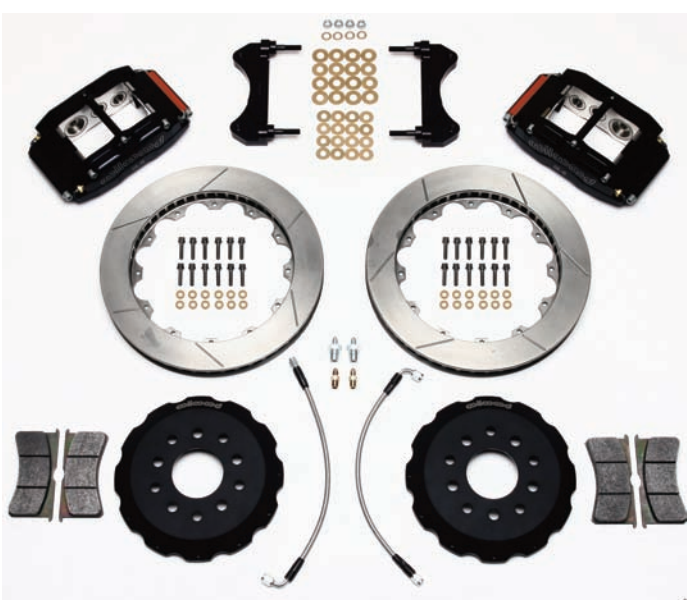
Front Brake Kit (Race) 140-7190

6R Big Brake Front Brake Kit (Race) part number 140-7190. This kit features forged billet aluminum There was a noticeable difference to the Trans Am in Superlite six-piston calipers with Thermlock pis-