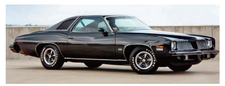
1973 Pontiac Grand Am

Pontiac made changes to the Firebird in 1970 and the GTO in 1973 and both shared the same spindle arrangement so the same brakes were used on both cars. Wilwood manufacturers brake kits for the 1970 to 1978 Firebird and the 1973 to 1977 GTO and Grand Am. The single piston brake was still being used so the D52 Caliper that we mentioned earlier would be the first easy brake upgrade that could be made. Installing the Dynapro Big Brake Front Brake Kit part number 140-1073 is the first substantial brake improvement Wilwood offers. The kit features the forged billet aluminum Dynapro six-piston caliper in a black finish. It works with the 12.19-inch rotor that is available in a standard or drilled and slotted style. Another kit that works great is the Superlite 6R Big Brake Front Brake Kit part number 140-10485. It features forged billet aluminum Superlite six-piston calipers in a black or red finish. The calipers work with 12.88-inch rotors in a slotted or drilled and slotted style.