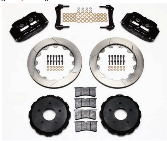
Brake Kit 140-8032

Wilwood also offers several rear disc brake kits for the 2005 and newer Corvette starting with the Superlite 4R Big Brake Rear Kit for OE parking brake system that is Wilwood part number 140-8032. The kit features Forged Superlite calipers in Platinum E or red or black powder coating, 12.88-inch rotors in slotted or drilled and slotted styles, caliper brackets and forged rotor adapter that works with the original parking brake mechanism.