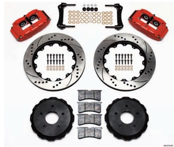
Brake Kit 140-9119

calipers with stainless steel pistons, high temperature seals, GT series directional Vane 12.88-inch competition rotors, forged aluminum hats and high friction race, compound pads. The competition kit is for use with the front race kit. If you use your Corvette for street driving or for action on the track, Wilwood offers a kit that will make it more fun to drive.