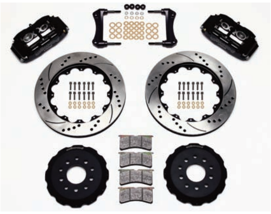
Brake kit 140-9298

A similar kit is also offered with large 14-inch rotors and it is Wilwood part number 140-9298. Wilwood also offers a rear rotor update for the Corvette that includes the rotors, aluminum adapter plates, brake pads, braided steel hoses and the necessary hardware to make the change. The Wilwood part number is 140-8314.