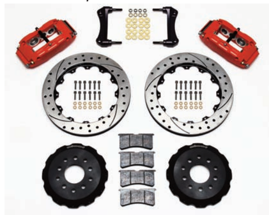
Brake kit 140-8337

Wilwood Engineering introduced a brake improvement for the 1988 through 1996 Corvettes. The brake kit being offered is the Superlite 6R Big Brake Front Brake Kit part number 140-8337 that features six-piston Forged Superlite calipers and large 12.88-inch rotors in slotted or drilled and slotted style. The big calipers are available in Platinum-E or red and black powder coat.