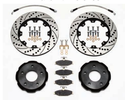
Brake kit 140-8314

The new 1997 Corvette was a big departure from the previous models and this car featured a front mounted engine and a rear mounted transmission to balance the front to rear weight distribution. The engine options were also changed and the car featured an all aluminum LS-1 engine that was developing 345 horsepower. This car also featured 18-inch rear wheels and 17-inch front wheels running unidirectional tires. The 1998 Corvette paced the Indy 500 and a special model was available. In 1999 the Corvette received a heads-up display that was projected on the windshield. A third coupe body style was also offered in addition to the hatchback and convertible, but it was a mystery why. Sales for the body style was very low but the mystery was solved when the Z06 option was released and was only offered in the lightweight coupe model. The Z06 featured a new LS-6 engine that delivered 385 horsepower for the '01 model and 405 for the '02 model year matching