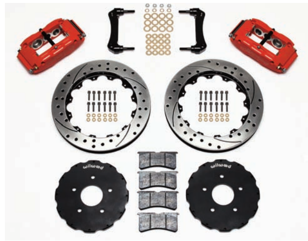
Brake Kit 140-8921

Wilwood has been offering brake improvement kits for Corvettes over the years and we are offering several race proven disc brake kits for the 2005 and newer Corvettes. One of the really impressive brake kits we offer is the Superlite 6R Big Brake Front Brake Kit part number 140-8921 that features six-piston Forged Superlite calipers in Platinum-E or black and red powder coating, and 13.06-inch rotors in a choice of slotted or drilled and slotted styles