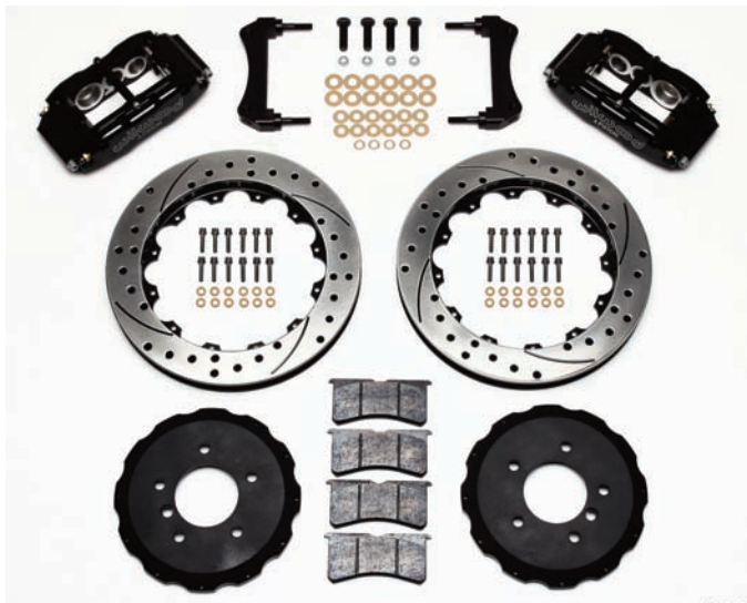
Brake Kit 140-8797

There are several powerful Wilwood brake upgrade kits for the BMW starting with the Superlite 6R Big Brake Front Brake Kit, part number 140-8797. The kit features forged billet Superlite six-piston calipers in a black finish that work with 13.06-inch rotors in a slotted or drilled and slotted style.