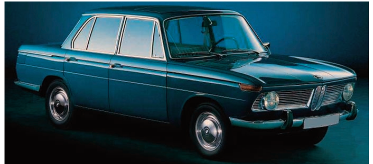
1962 BMW 1500 sedan

the rear window line that has been a hallmark of all BMWs since then.