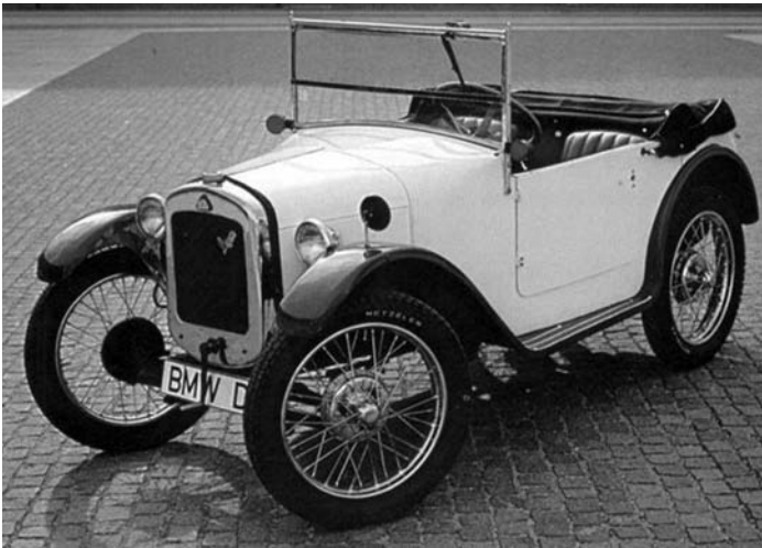
1929 BMW Dixi Roadster

After producing a successful motorcycle division that was selling well, BMW wanted to build an automobile division. The designers and engineers started working on a car design in 1925 and a few prototype cars were made. In 1928 BMW expanded into full car production with the purchase of the Eisenach Car Factory that made the Dixi (or Austin Seven and it was manufactured under license). The original car was called the BMW 3/15 and offered several body styles. After the success with that car, it didn't take long for new advanced designs to emerge.