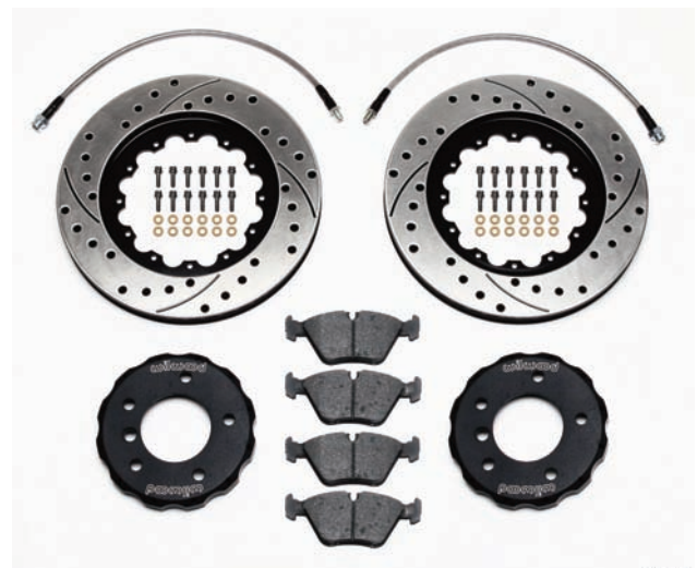
Brake Kit 140-8801

An easy upgrade kit for your BMW would be the Promatrix Front Replacement Rotor Kit, part number 140-8801 that features 12.40-inch rotors, aluminum hats, brake pads and braided steel hoses