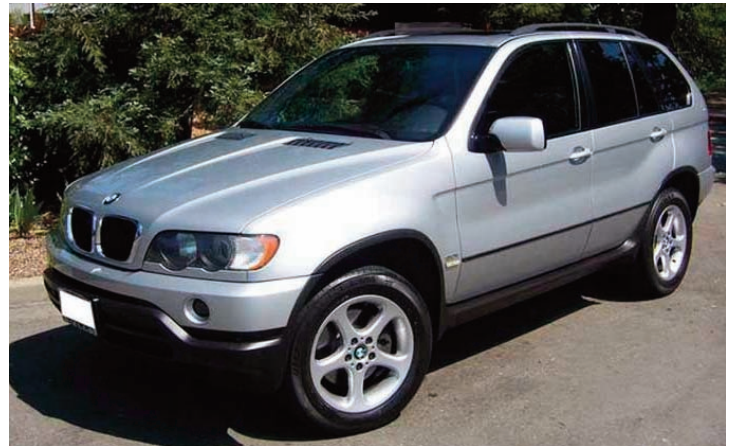
2002 BMW X5

BMW and Rolls-Royce also teamed up to produce some special models. The result of their efforts was the Rolls-Royce Silver Seraph and the Bentley Arnage. High performance BMW engines power both of the cars.