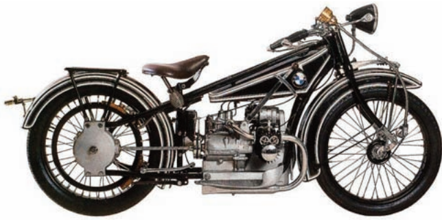
1923 R 32 BMW Motorcycle

torcycle, the R 32 in 1923 and it became very successful due to its advanced design qualities.