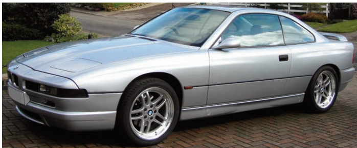
1989 BMW 8-Series