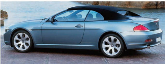
2004 BMW 645CI Convertible

In early 2000, BMW underwent the redesign of most of the BMW models under the auspices of the newly promoted design chief, Christopher Bangle. The new controversial designs featured complex concave and convex curved surfaces, combined with sharp panel creases and slashes. It was a design cue called "Flame surfacing". Enthusiasts and the automotive press received the new designs with mixed reactions but overall sales were good and the newly designed cars have become accepted by everyone.