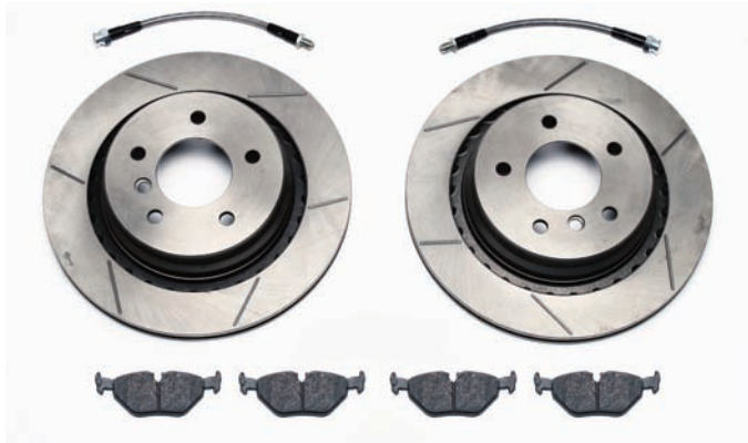
Brake Kit 140-8802

In early 2000, BMW underwent the redesign of most of the BMW models under the auspices of the newly promoted design chief, Christopher Bangle. The new controversial designs featured complex concave and convex curved surfaces, combined with sharp panel creases and slashes. It was a design cue called "Flame surfacing". Enthusiasts and the automotive press received the new designs with mixed reactions but overall sales were good and the newly designed cars have become accepted by everyone.