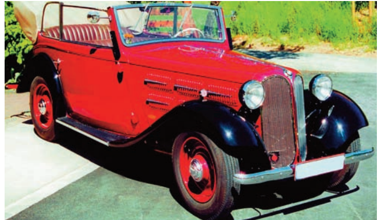
34 BMW Convertible

Porsche. After that I6 was successful, BMW released the 327 coupes and convertibles, the 328 roadsters, and the luxury 335 sedans. The cars were fast and very advanced for the time.