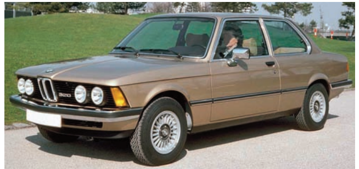
1977 BMW 3-series 320i

The new class 1500 was developed into the 1600 and 1800 models. In 1966 the new two-door version of the 1600 was launched and the following year the convertible was released. The models just mentioned became the 2-series cars. The 2-series continued until 1976 when they were replaced by the 3-series BMW.