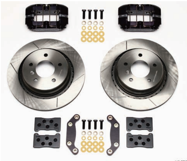
Brake Kit 140-8798