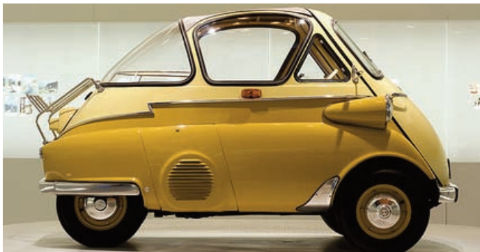
1955 BMW Isetta

BMW started producing the 503 and 507 models, but both were too expensive to build profitably and were low volume cars. BMW also built a small car, the Isetta and it saved the company after the war during the '50s. In 1959 BMW survived several takeover attempts from American Motors and the Rootes Group. The Quant group who was the major stockholder in the company increased their holdings in the company and by 1960 they had a 2/3 interest.