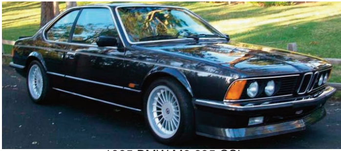
1985 BMW M6 635 CSi

with the Mini and Land Rover brands, so in 2000 BMW disposed of Rover with the cars going to the Phoenix Venture Holdings and Land Rover going to Ford Motor Company.