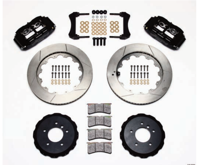
Brake Kit 140-9300

Another powerful brake kit is the Superlite 6R Big Brake Front Brake Kit, part number 140-9300. The kit features forged billet Superlite six-piston calipers in a black finish that work with 14-inch slotted rotors.