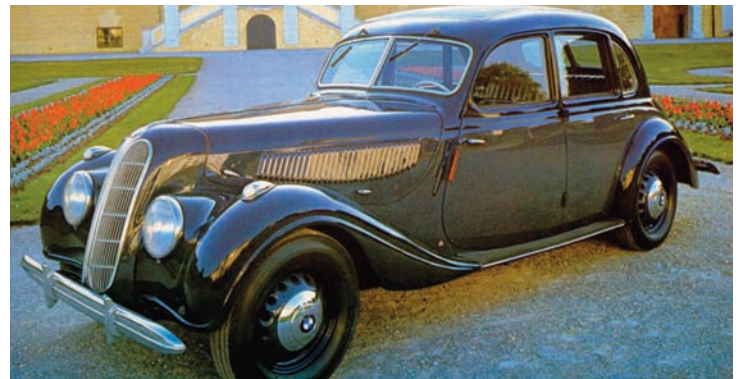
1935 BMW 335 Sedan