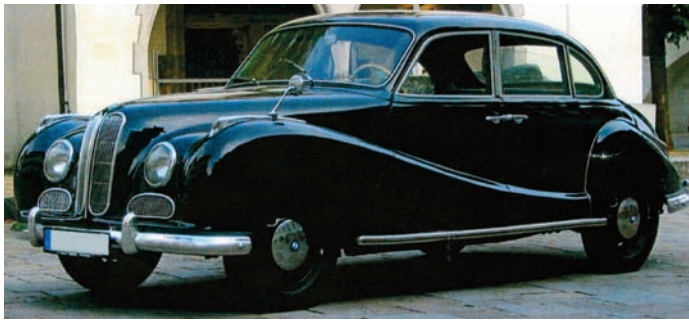
1952-1958 BMW Saloon