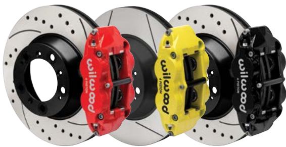
Superlite Rear Brake Kits