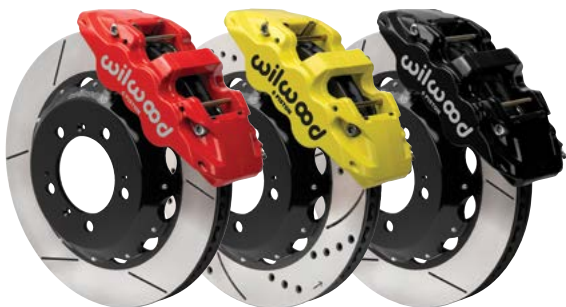
Aerolite Front Brake Kits