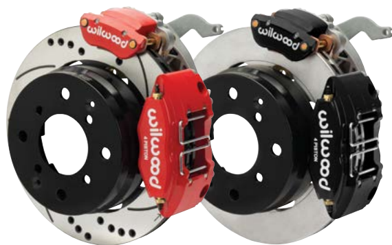
Powerlite Rear Brake Kits