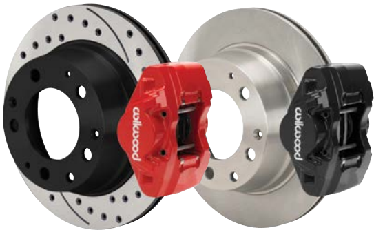
D31 Rear Brake Kits