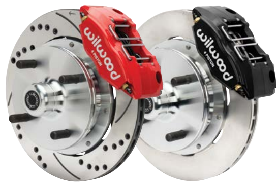
Powerlite Front Brake Kits

NOTE: These brake kits MUST be used with a 19mm master cylinder, as used in the 914/6 or 911.