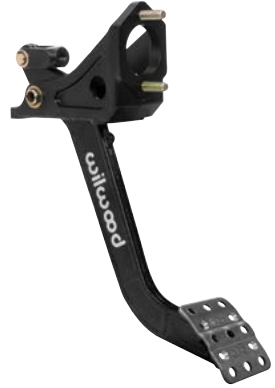
340-13574 6:1 Reverse Swing Mount Clutch/Brake Pedal