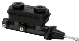
Tandem Master Cylinder