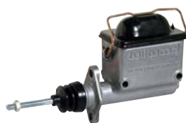
High Volume Master Cylinder