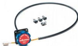
340-4990 Remote Bias Adjuster