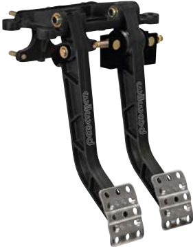
340-11295 6.25:1 Swing Mount Brake and Clutch Pedal