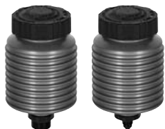
Lightweight Reservoir Kit