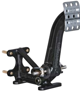
340-13831 6:1 Floor Mount Brake Pedal