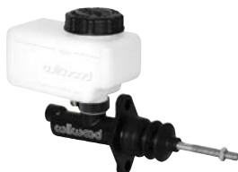
Compact Remote Flange Mount Master Cylinder with Plastic Reservoir