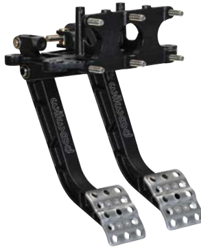
340-11299 6.25:1 340-13835 5.1:1 340-13836 6.25:1/5.1:1 Reverse Swing Mount Brake and Clutch Pedal