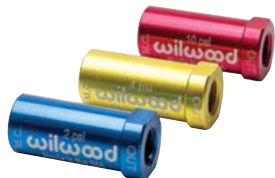
Residual Pressure Valve