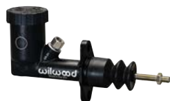
260-15098 3/4" GS Compact Integral MC