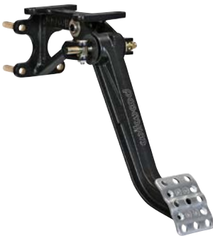
340-13832 7:1 Swing Mount Brake Pedal