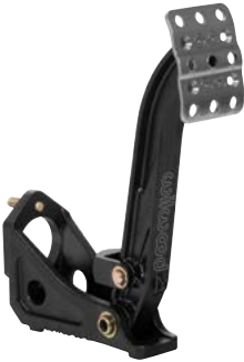
340-13833 6:1 Floor Mount Clutch/Brake Pedal