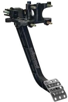
340-12509 6.25:1 340-13837 5.1:1 Reverse Swing Mount Brake and Clutch Pedal