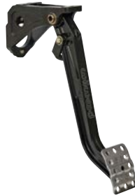
340-13834 7:1 Swing Mount Clutch/Brake Pedal