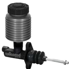
Compact Remote Flange Mount Master Cylinder with Lightweight Reservoir Kit