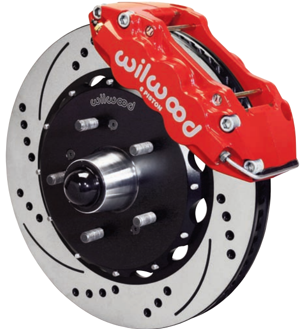
Front Brake Kit Assembly