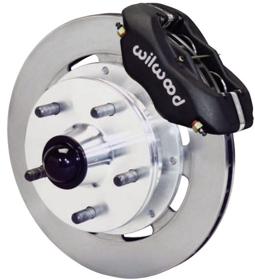
Front Dynalite Classic Series Kit Assembly