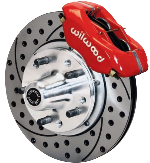
Dynalite Pro Series Front Kit Assembly Download High Resolution Photo, Click Here