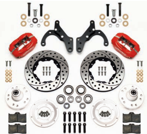
Dynalite Pro Series Complete Kit Download High Resolution Photo, Click Here