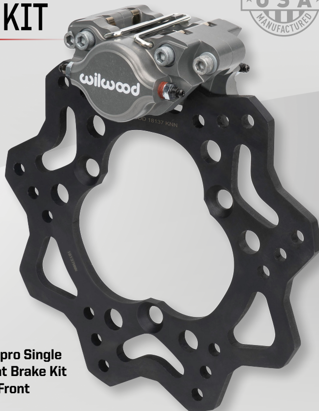
Dynapro Single Sprint Brake Kit Left Front