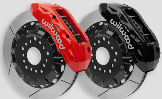
P/N 140-18123-R GTB Slotted Rotor