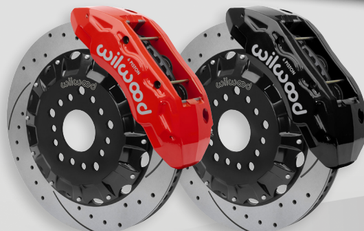
P/N 140-18123-DR SRP Drilled & Slotted