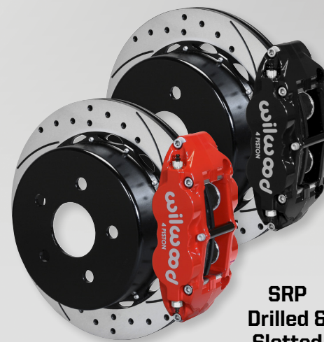
SRP Drilled & Slotted Rotors