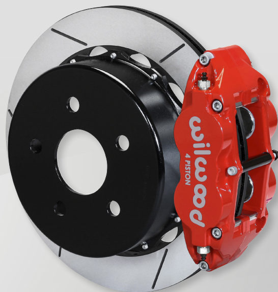
FNSL4R Four Piston Brake Kit 13.50" GTB Slotted Rotor