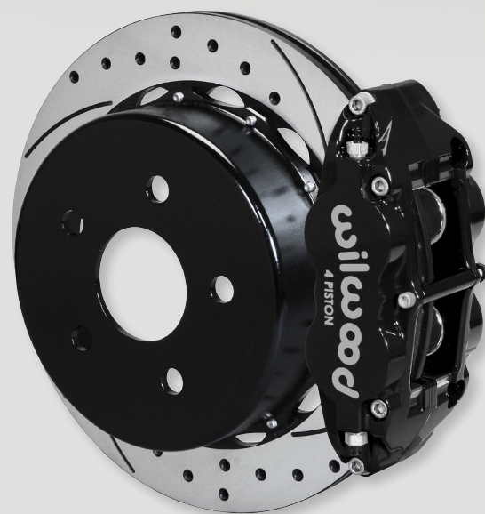
FNSL4R Four Piston Brake Kit 13.50" SRP Drilled & Slotted Rotor