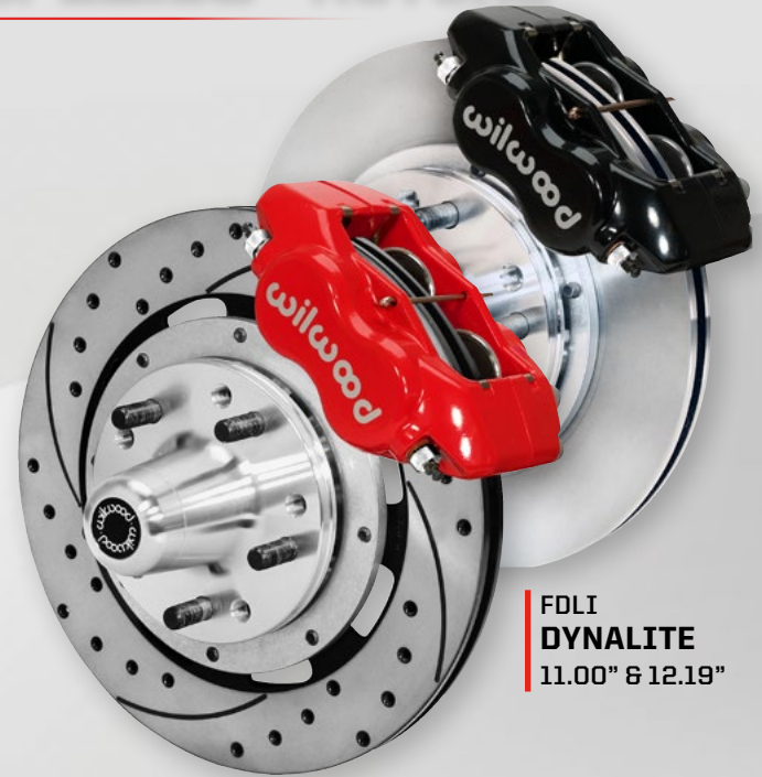
FDLI DYNALITE 11.00" & 12.19"