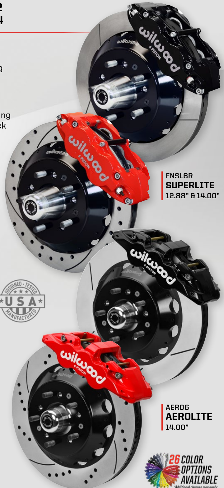
FNSL6R SUPERLITE 12.88" & 14.00"