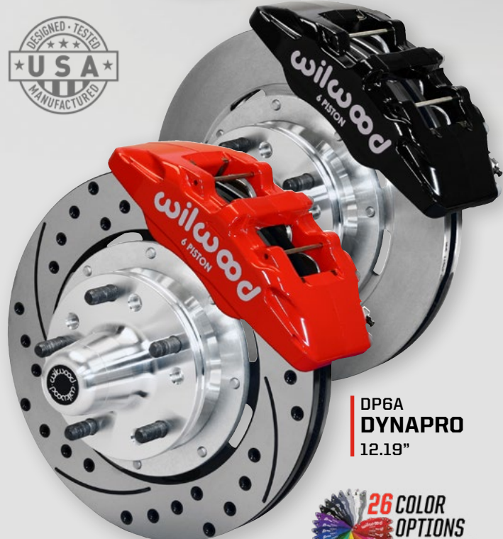
DP6A DYNAPRO 12.19"