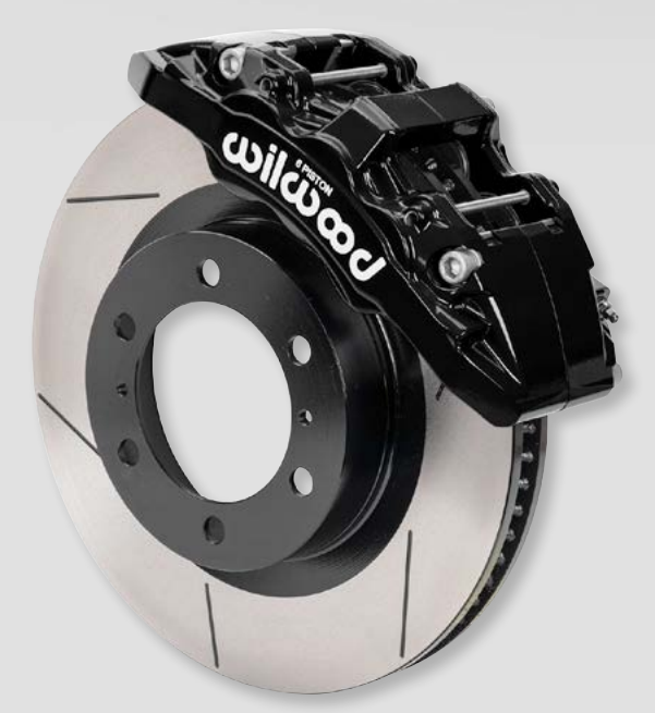
Aero6-DM Six Piston Brake Kit 13.31" GT Slotted Rotor