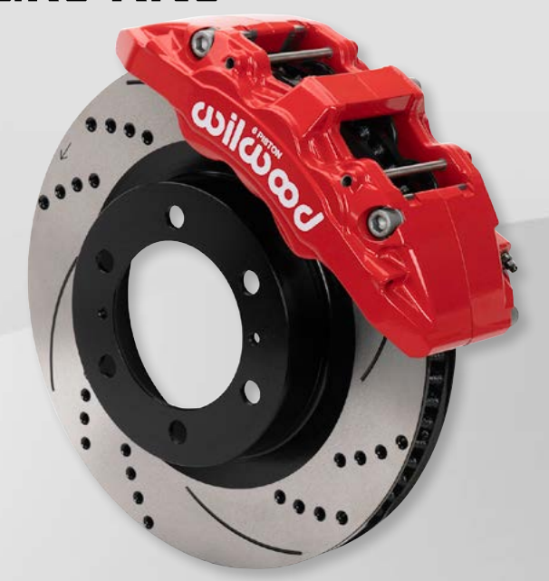
Aero6-DM Six Piston Brake Kit 13.31" SRP Drilled & Slotted Rotor

Stainless steel Flexlines and premium-grade hardware included