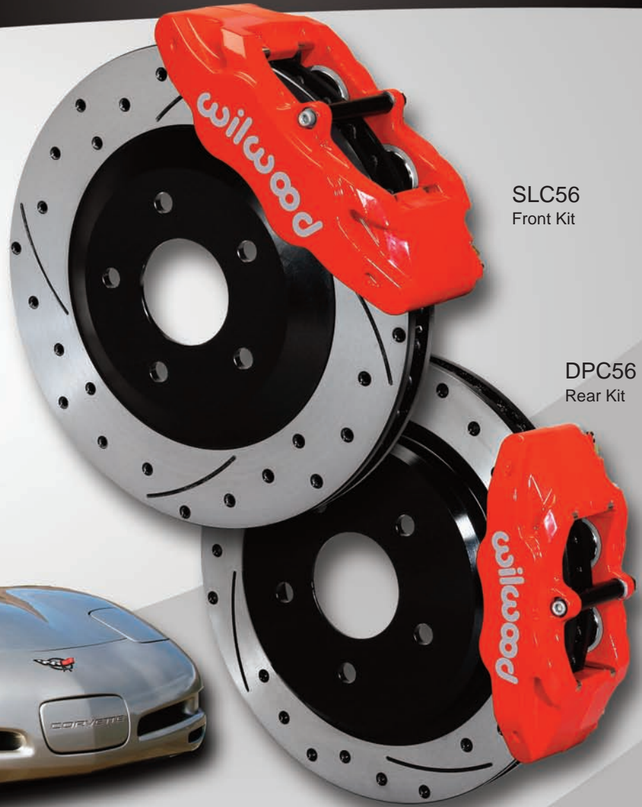
SLC56 Front Kit