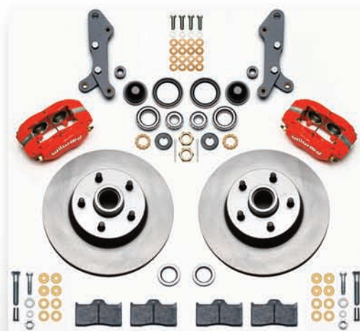
Dynalite Kit Shown with HP Rotors

PLEASE CHECK: WILWOOD ALWAYS RECOMMENDS CHECKING www.wilwood.com FOR COMPLETE YEAR / MAKE / MODEL APPLICATION DATA AND SPECIFIC WHEEL CLEARANCE REQUIREMENTS.