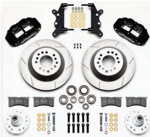
Superlite Kit Shown with 1-Piece GT Rotors