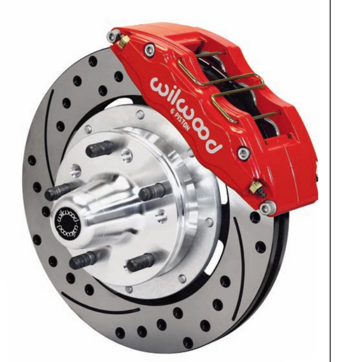
Front Kit with SRP Rotor and Red Caliper Download high resolution photo, click here