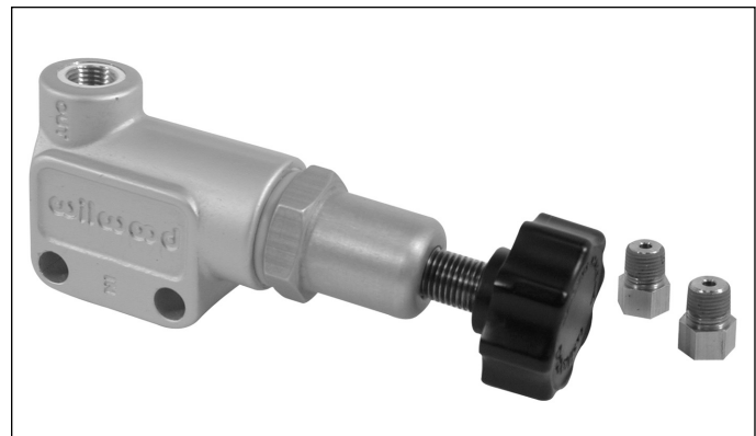
Knob Adjustable Proportioning Valve - P/N 260-8419