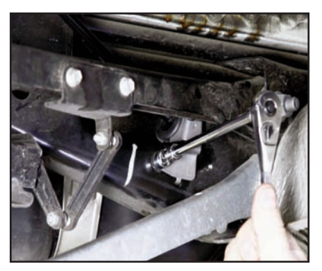
Figure 8 Page 3