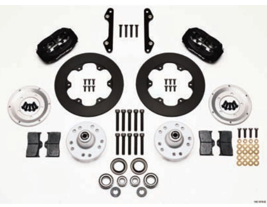
Brake Kit 140-1019-B

Dynalite Front Drag Brake Kit part number 140-1019-B. The kit features Forged Dynalite four-piston calipers in a Platinum-E finish. The calipers work with 10.75-inch lightweight rotors that feature a standard or drilled style.