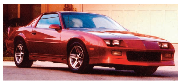
In 1991 Chevy brought the Z/28 back as the top performance model and Chevy enthusiasts were not happy about the loss of the IROC designation. There was a new Camaro on the way so the Camaro remained essentially the same from 1991 to 1992.

used the IROC package as the top performance option. The normal Camaro was now offered with the optional Z/28 five-spoke wheels and the ground effects package. The Z/28 170 horsepower engine was also optionally available. Chevy also released a new performance package for enthusiasts who were interested in road racing. The 1LE package included the 305 and 350ci Tuned Port Injected engines, oversize brakes, an aluminum drive shaft and improved suspension. It was built to win showroom stock road races. The '89 Camaro was very similar to the '88 but the RS (not Rally Sport) package was brought back and it was a trim level that included improved wheels, ground effects, and a rear spoiler that could be installed on the base Camaro. The IROC was still the top performance package and that continued until 1990 when Chevy dropped the sponsorship.