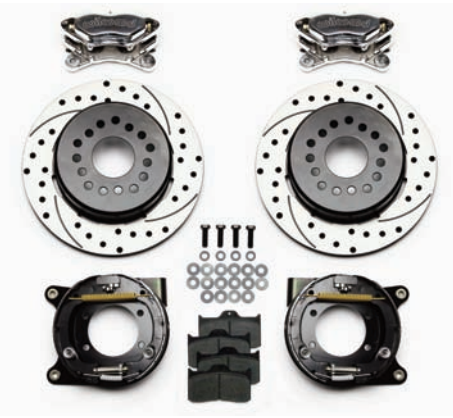
Brake Kit 140-7149

Wilwood also offers a rear brake kit for Camaros the Forged Dynalite Rear Parking Brake Kit part number 140-7149. The kit features Forged Dynalite four-piston calipers in Platinum-E, Red or Polished finish. The calipers work with 12.19-inch rotors in a standard or drilled and slotted style and they are designed to work with the internal drum parking brake system.