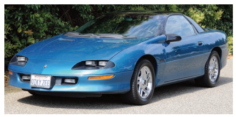
In 1996 the Z/28 horsepower jumped to 285 and a SS package became available. The SS package was a performance option that increased the engine horsepower to 305, the first to break the 300 horsepower barrier since 1971 and the first using net ratings. The SS model had new badges to identify it, but overall it remained subtle, just the way Chevy wanted it.

Camaro was also very similar to the previous models but it was available with traction control and all weather tires. The '95 also received a new 200 horsepower V6 engine that was available as an option.