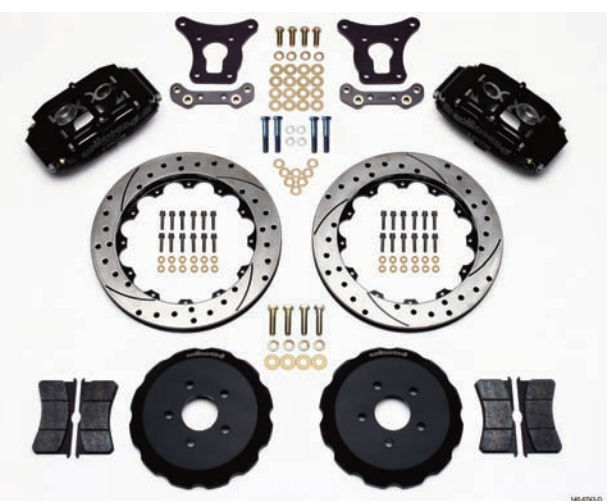
Brake Kit 140-6743

ted style and they work with the, internal drum parking brake. When the front and rear kits are installed on a '93-'97 Camaro the cars ready for high performance street or track action.