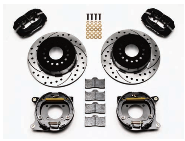
Brake Kit 140-7148

Enthusiasts with IROC Camaros that wanted superior stopping power could order the Wilwood Forged Dynalite Big Brake Kit part number 140-11275. The kit features Forged Dynalite Calipers in Black and 12.19-inch rotors in standard or drilled and slotted styles. If you want rear brakes you can outfit your Camaro with a Forged Dynalite Rear Parking Brake Kit part number 140-7148. The kit features Forged Dynalite four-piston calipers in a Platinum-E or Red finish. The calipers work with 12.19-inch rotors that are available in a standard or drilled and slotted style and are designed for use with an internal drum parking brake system.