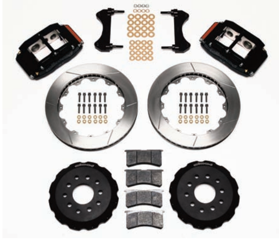
Brake Kit 140-7763

If you have a Camaro that is street driven or just occasionally track driven we have three kits that will improve your brake system. The Superlite 6R Big Brake Front Brake kit part number 140-7763 is perfect for your car. The kit features forged billet Superlite six-piston calipers in a Black finish along with 12.88-inch slotted or drilled and slotted rotors.