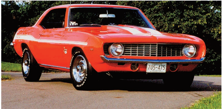
Wilwood recognized the performance of the Camaros early on, as well as their popularity, so the

Am racing. The new Camaro was built to handle few nice changes to the Camaro body and they released the '69 Camaro, which ultimately became a classic. The Camaro looked lower and more muscular due to the bodyline and wider because of the grille design so Chevy enthusiasts loved the new car. The regular performance engine options were retained, but there were two special Central Office Production Orders 9560 and 9561 signed off by management, so that the factory could install 427 engines. COPO 9561 allowed the installation of 427 steel block engines in Camaro Sport Coupes and 1,015 were produced with many going to special performance dealerships. COPO 9560 was for drag racers and it allowed an aluminum 427ci engine to be installed in a Camaro Sport Coupe. Both of the 427 Chevy engines were producing 425 horsepower and the lightweight aluminum version was doing great in Super Stock drag racing. Only 69 aluminum 427ci powered Camaros were built for drag racers and they are desirable collector cars today. The aluminum 427 Camaros sold for about twice the price of a regular one. This was also the best year for Z/28 Camaros because a new cowl induction hood was released, and along with the front and rear spoiler, the car looked fantastic. The engine block was also strengthened and had a DZ designation for identification.