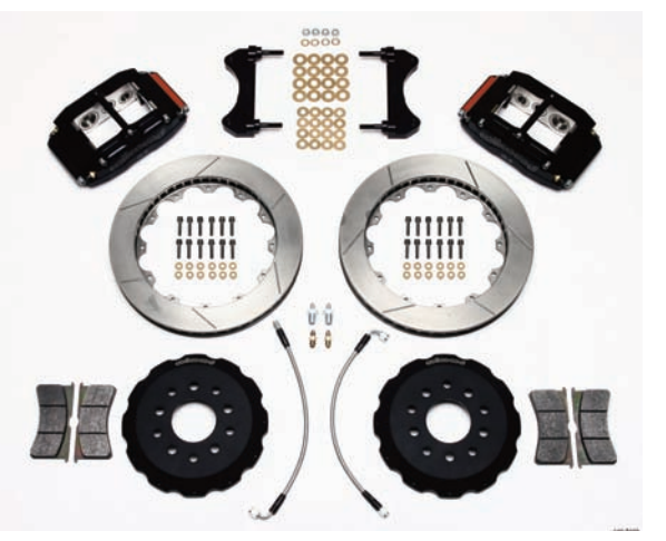
Brake Kit 140-7190

Two similar kits are available, part number 140-9833 features 13.06-inch rotors and part number 140-9834 features 14-inch rotors. Some road racing classes only allow four-piston calipers so Wilwood offers the Superlite 4R Big Brake Front Brake Kit (race) that is part number 140-10691 for your track star. The kit features billet Superlite BSL4R/ST calipers with thermlock pistons, 12.19inch directional vane rotors with forged billet hats, caliper brackets, race compound pads, hoses, and all of the hardware required to complete the installation.