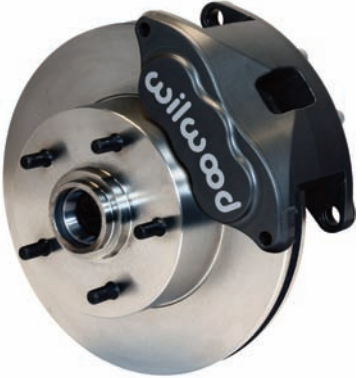
D52 Brake Caliper

company developed several disc brake kits that will allow them to perform as well as a brand new car. Since the Nova and Firebird share the same platform as the Camaro, the brakes kits will fit them as well. If you have a '68 or '69 Camaro with disc