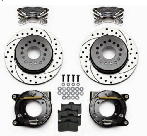
Brake Kit 140-7149

Wilwood also offers rear brake kits for the Camaro and one is the Forged Dynalite Rear Parking Brake Kit part number 140-7149. The kit features Forged Dynalite four-piston calipers in Platinum-E, Red or Polished finish. The calipers work with 12.19-inch rotors in a standard or drilled and slotted style that works with Wilwood's internal drum parking brake system, There are additional kits available so you will have to select the correct one to fit your particular application