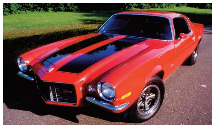
This was also the end of the two-year car cycle because the second generation Camaro body design ran from 1970 to 1981 with only small engineering and design changes to meet fuel regulations and safety requirements. When the stylists and engineers were building the Camaro and Firebird they knew it had to have a body would last for 10 years or more so they met their goal. In an effort to meet many governmental fuel and emission mandates the engine performance suffered throughout the '70s, but by the '80s things started to improve.

14.2 seconds at 100.3 miles per hour, but with a few minor tuning tricks the Camaro would get into the high 13s. The Camaro also offered the Super Sport package and it could be optioned with a 300 horsepower 350ci engine and a 396ci engine rated at 325 and 375 horsepower. Chevy also offered a Rally Sport option that included trim additions and a nice looking split front bumper.