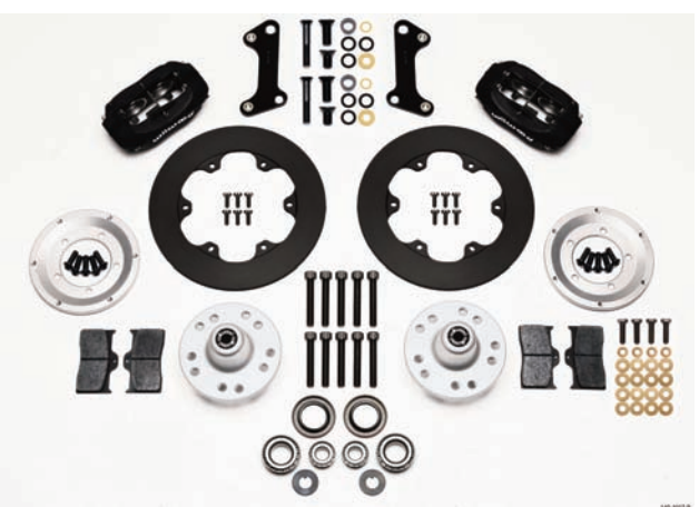
Brake Kit 140-1017-B

Drag racers will be glad to know that Wilwood makes a drag racing brake kit that is 30 pounds lighter than the stock system, the Forged Dynalite Front Drag Brake Kit part number140-1017-B. The kit features Dynalite four-piston calipers with a Platinum E finish. The kit works with 10.75-inch rotors in a standard or drilled style..