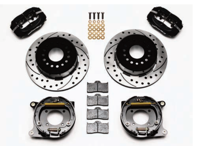
Brake kit 140-7148

Chevy finally decided to make an improvement on the Camaro, so they changed the front fascia with new headlights and a grille change. What buyers really liked about the updated Camaro was the new aluminum LS-1 engine option that was producing 320 horsepower. This was basically the same engine being used in the Corvette. Sales for the updated Camaro was still respectable with 77,198 cars being produced. Chevy made the styling upgrade because they knew the present Camaro body style was dated and they were aware that a new one was needed. The Camaro still had respectable sales although less than in previous years, but they needed to sell 50,000 cars to make a good profit. This was happening at a time when SUV and pickup truck sales started to increase, and without any marketing for the Camaro similar to the IROC connection, the sales