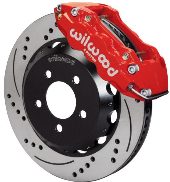
Pontiac Front Kit Assembly