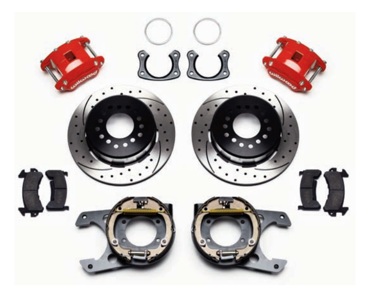
Rear Parking Brake Kit Components with Optional Red Calipers and Drilled Rotors