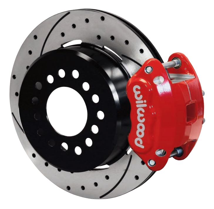
Rear Parking Brake Kit Assembly with Optional Red Caliper and Drilled Rotor

For more information or to obtain high resolution photos for printing, contact: Wilwood's Marketing Department at (805) 388-1188.