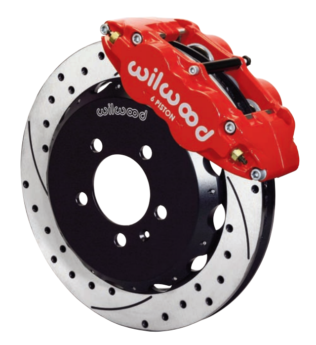
Volkswagen Brake Kit Assembly Download High Resolution Photo, Click Here

Wilwood performance brake kits are loaded with cutting edge technology built on years of domination in world motorsports, and proven reliable through Zero PPM defect supply to OEM's. Wilwood's Big Brake Kits are designed to meet the high performance demands of today's tire, wheel and suspension technology.