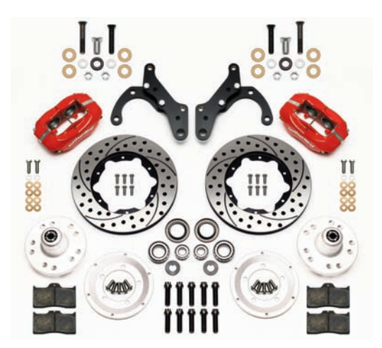
Dynalite Pro Series Complete Kit Download High Resolution Photo, Click Here

spindle using tapered roller bearings and races. Every hub is "factory offset" designed to minimize hub track width change and reduce any possibility of tire to fender interference when changing from stock brakes. In addition to their strength, the forged billet hubs and modular design rotor mount plates provide a substantial weight savings over their steel and iron counterparts.