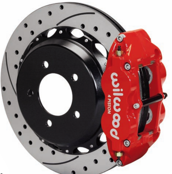
FNSL4R Rear Kit Assembly To Download High Res Photo, Click Here