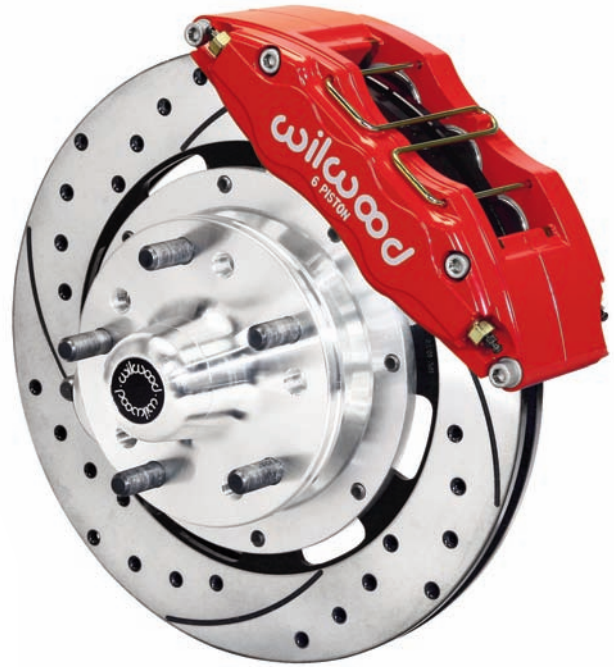
Front Kit with SRP Rotor and Red Caliper

Download high resolution photo, click here