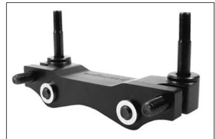
Powerlite Caliper Mounting Bracket