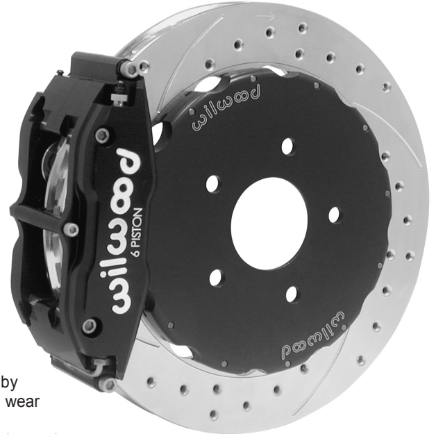
Mustang Big Brake Front Kit with SRP Rotor