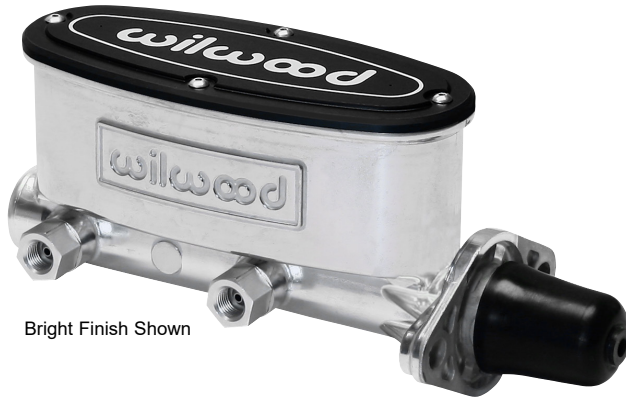
Bright Finish Shown

260-8555/-P/-BK • 260-8556/-P/-BK 260-9439/-P/-BK • 260-13375/-P/-BK