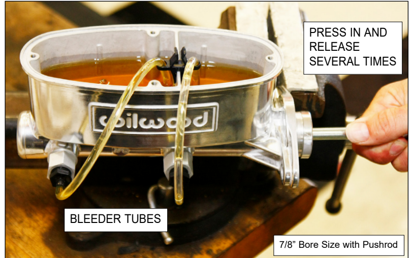
Typical Bleeder Tube Setup and Use