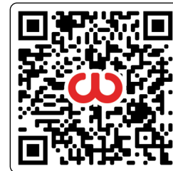
Scan to Watch Video How to: Bench Bleed a Master Cylinder