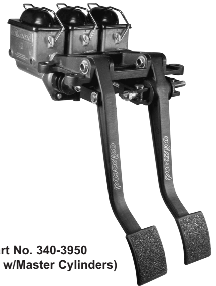
Part No. 340-3950 (Shown w/Master Cylinders)

•Wilwood's forward mount dual pedal assembly must be mounted using the four outboard tab mounting holes. Attach the pedal assembly to two sturdy beams or plates with four 5/16 inch bolts. Pedal assembly must be rigidly attached to frame and not deflect under heavy pedal forces. Pedals must be free from obstructions over their entire range of motion. Allow enough space so balance bar adjustments can be made and masters cylinders are accessible.