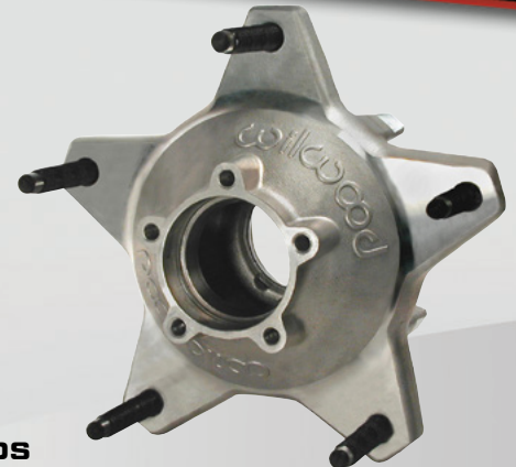
Starlight 55 Rear Hub Long Stud (Bare Finish)

ORDERING INFORMATION: PH: 805.388.1188 • FAX: 805.388.4938 • wilwood.com • info@wilwood.com