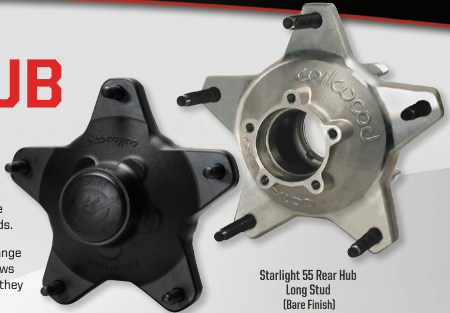
Starlite 55XD Front Hub with Snap Cap (Black E-Coat Finish)

Starlite 55 front hubs eliminate all the bosses and bolts with the Snap-Cap. A lighter fiber-reinforced composite plastic cap that simply snaps into place.