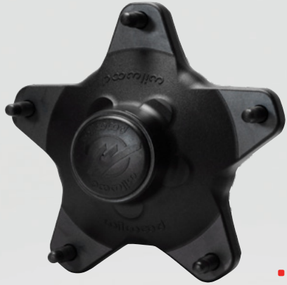
Starlite 55XD Front Hub with Snap Cap (Black E-Coat Finish)