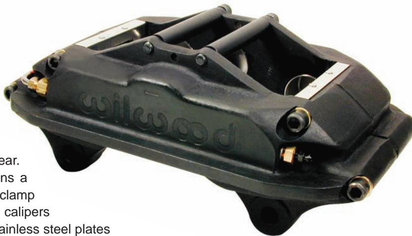
GN III Caliper

High strength, low deflection, and superior stopping power. Each GN III is manufactured from a precision casting using a tight grained, high-density aircraft alloy. It is a two piece, closed bridge design with grade 8 thru-bolts and external stiffening ribs. The GN III utilizes a unique six-piston configuration that generates high clamping force with balanced loading for extremely even pad wear. The 1.75" / 1.38" / 1.38" bore pattern contains a total of 5.44 square inches of effective piston clamp area. This makes the GN III one of the largest calipers available. The caliper bridges are fitted with stainless steel plates to reduce wear and provide the smoothest pad operation. Dual center bridge bolts add to the overall caliper strength and provide positive retention for the top loaded pads. Dollar for dollar, this combination is unmatched for high strength, low deflection, and superior stopping power.