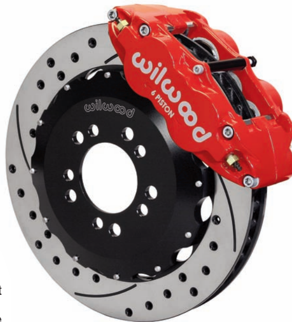
FNSL6R Kit Assembly, 13.06" Shown To Download High Resolution Photo, Click Here