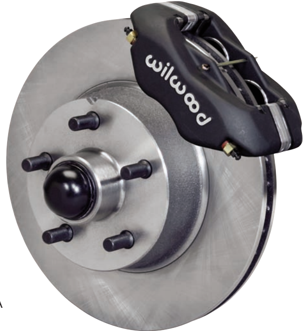
Front Dynalite Classic Series Kit

Download high resolution photo, click here