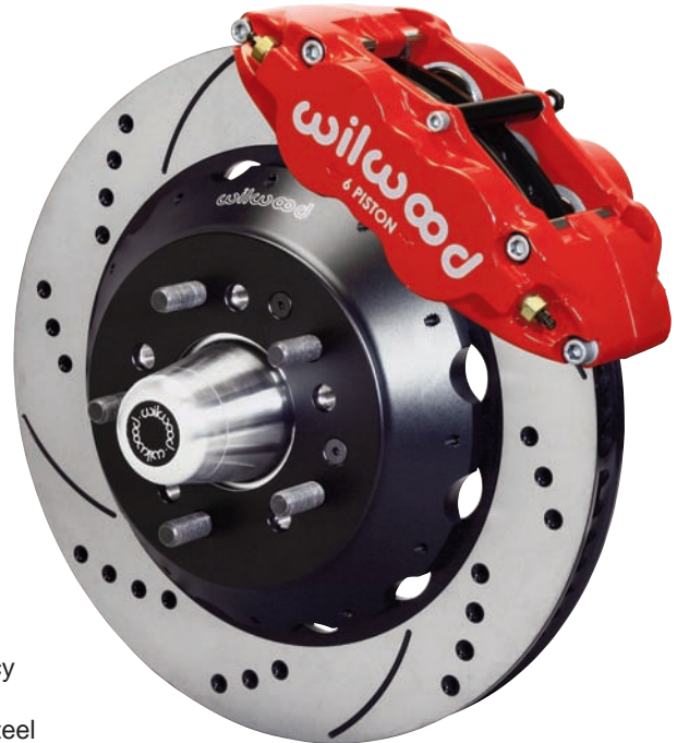
Big Brake Front Kit with SRP Rotor and Red Caliper

Download High Resolution Photo, click here