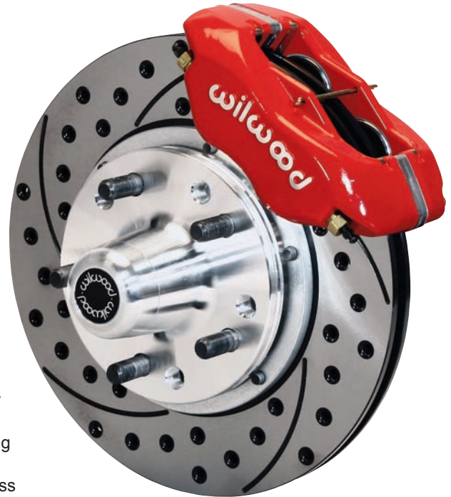
Pro Series Front Kit with SRP Rotor and Red Caliper Download High Resolution Photo, click here