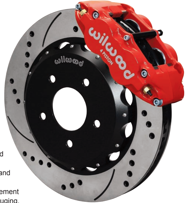
Jeep Big Brake Front Kit with SRP Drilled and Slotted Rotor Download high resolution photo, click here