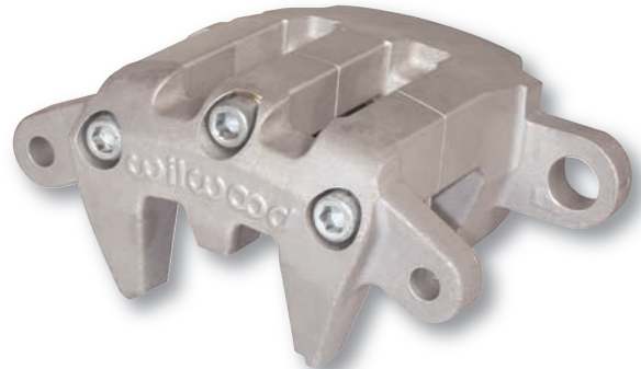
Wilwood Aluminum Caliper

Lightweight and strong, these high density cast aircraft alloy aluminum calipers feature Wilwood's triple bridge design for the highest possible resistance to body separation and deflection under load. All load bearing and stress points have been fortified to maximize strength, and all unnecessary weight has been removed. Each caliper is assembled with a stainless steel piston and high temperature bore seal for the ultimate in heat control, corrosion resistance, and durability in extreme conditions.