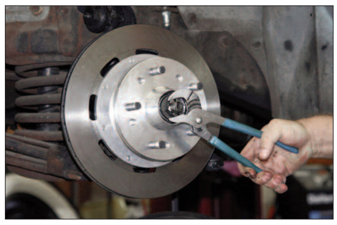
Sequence 16: Install spindle nut. Adjust bearings by tightening the wheel bearing nut to 60 in-lbs. while turning the hub/rotor assembly. Back off the adjusting nut one slot and install a new cotter pin (not supplied). The resulting adjustment should be zero (no pre-load to 0.003 inch end play.