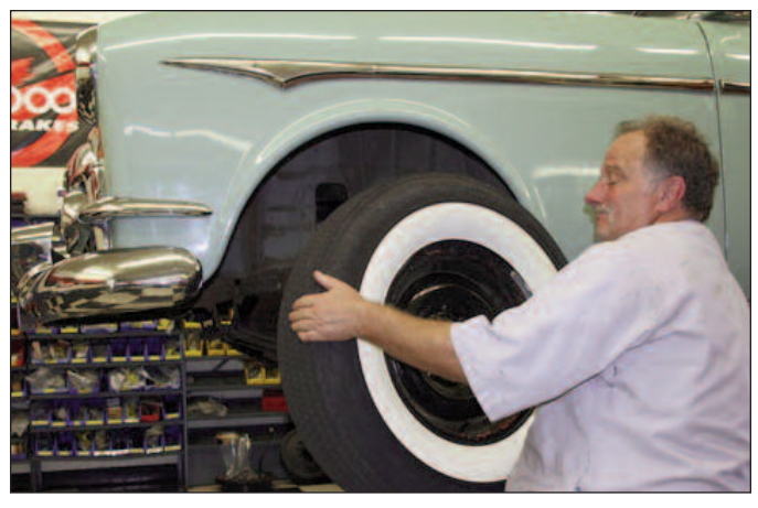
Sequence 1 : Raise the front wheels off the ground and support the front suspension according to the vehicle's manufacturer's instructions. Remove the lug nuts, and then slide off the wheel.