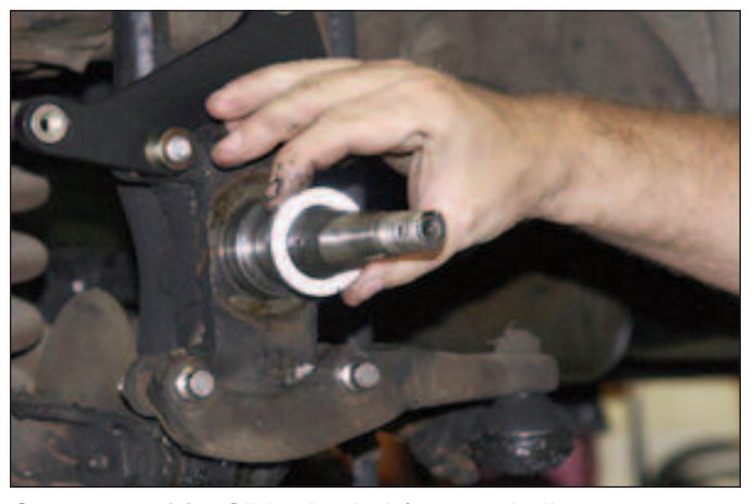
Sequence 14 : Slide the hub/rotor spindle spacer onto the spindle being sure to have the chamfer edge inward.