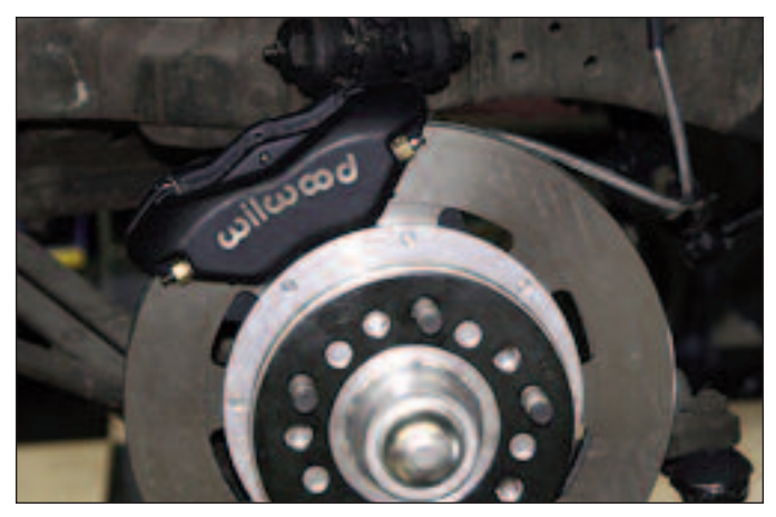
Sequence 22 : Connect one end of the flexline to the previously installed caliper fitting. Route line along a similar path as the OEM hose.