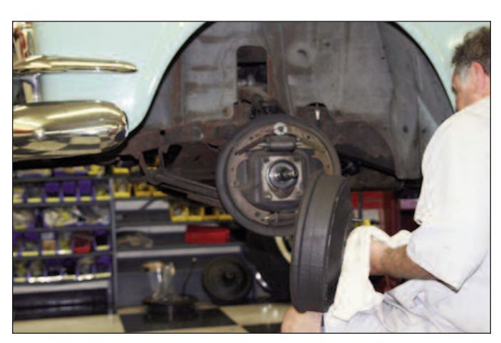
Sequence 5: Lift off the brake drum and set aside.