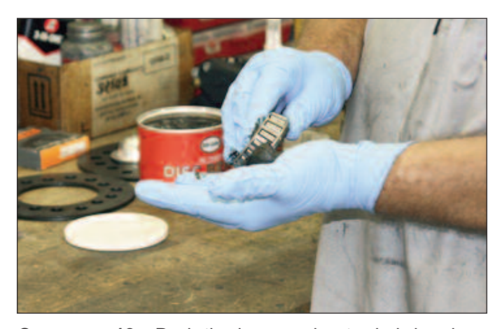
Sequence 12 : Pack the inner and outer hub bearings using a liberal amount of disc brake bearing grease (Available from your local auto parts store).