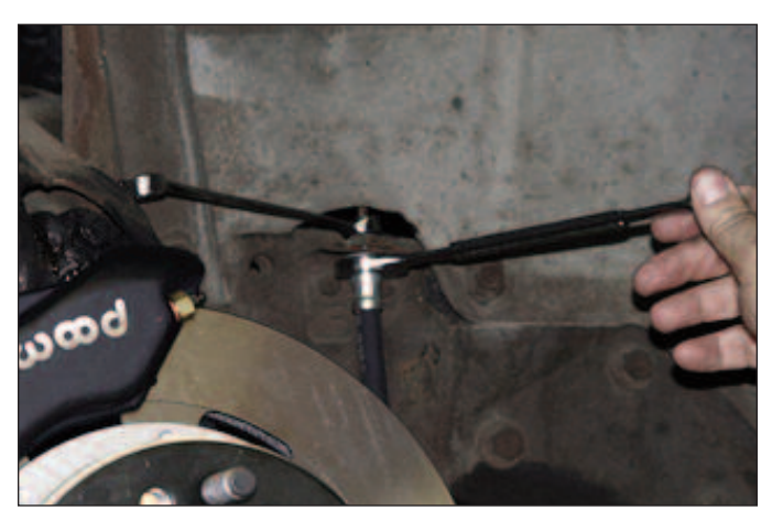
Sequence 23 : Connect the other end of the flexline to the fitting at the brake hard line and install new clip. Secure line as necessary to prevent contact with moving suspension, brake, or wheel components. Bleed the system referring to the additional information in the data sheet as necessary for proper bleeding instructions.