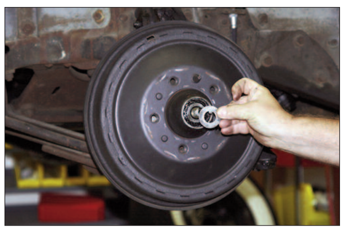
Sequence 4 : Unscrew the spindle nut and remove the indexed retaining washer.