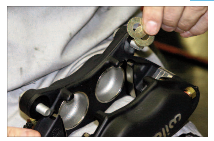
Sequence 19 : Initially place two shim washers on each bolt between caliper mounting tab and the mounting ears on the bracket.