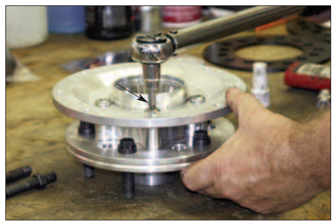
Sequence 11 : You must assemble the new hub, rotor adapter and rotor. Using the lug pattern that fits your wheels, install the supplied lug bolts into the hub and torque to 77 ft-lbs. Attach the rotor adaptor by applying Red Loctite <sup>®</sup> 271 to the bolt threads. Tighten in a crisscross pattern to 55 ft lbs.