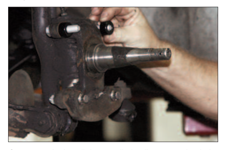
Sequence 9 : Install the supplied caliper mounting bolts and spacers from the inboard side. Use one spacer on each bolt.