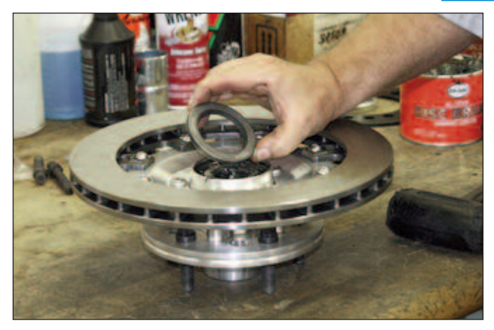
Sequence 13 : Install the bearing into the hub. Install the grease seal by pressing into the backside of the hub/rotor, flush with the end of the hub section.