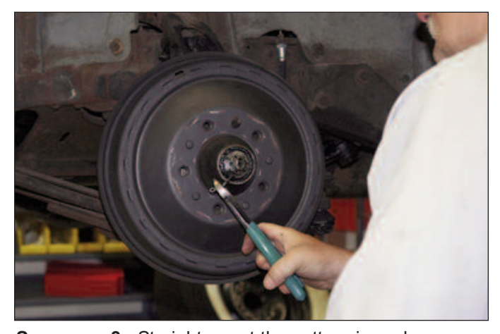
Sequence 3 : Straighten out the cotter pin and remove.