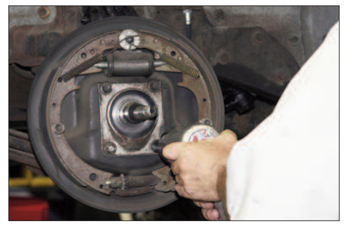
Sequence 7 : Remove all four nuts that secure the backing plate. Remove the mounting clip and disconnect the OEM rubber brake hose from the hard line. Cap line to keep fluid leakage to a minimum. Completely remove drum assembly. Clean and grease the spindle.