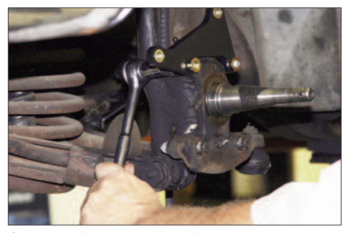
Sequence 10 : Attach the Wilwood caliper mounting bracket to the OEM mounting ears on the outboard side making sure clinch nuts are facing outward. NOTE: The bracket must fit squarely against the mounting ears. Inspect for interference from casting irregularities, burrs, etc. Grind as necessary. Apply red Loctite ® 271 to the threads and torque the bolts to 60 ft-lbs.