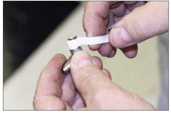
Sequence 18 : Remove the protective sticker from the caliper fluid inlet. Wrap the inlet fitting with PTFE thread tape and screw into the caliper with the outlet facing rearward parallel with the caliper body.