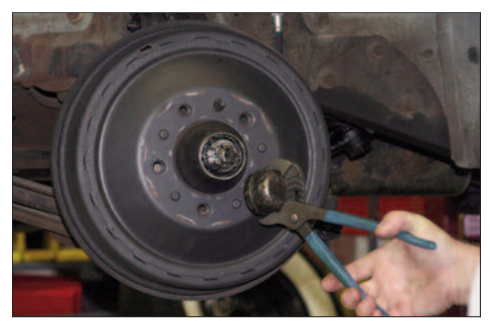
Sequence 2: Remove the dust cap.