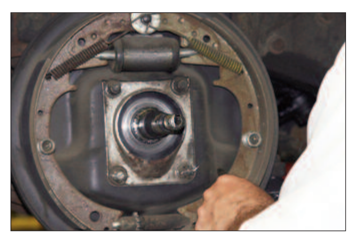
Sequence 6 : Straighten and remove the two cotter pins that secure the two bottom bolts holding in place the drum brake assembly and steering arm.