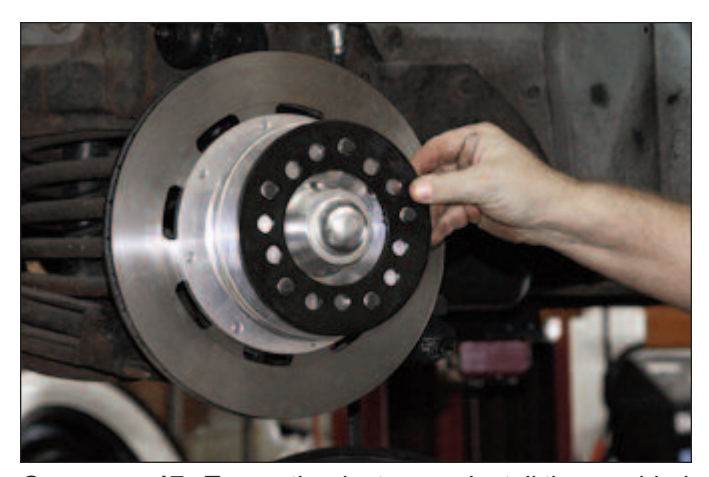
Sequence 17 : Tap on the dust cover. Install the provided wheel spacer. This spacer provids the best matting surface between the hub and stock steel wheels.