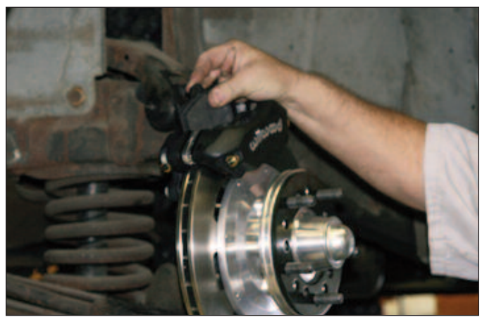
Sequence 21 : Insert the brake pads into the caliper with the friction material facing the rotor.