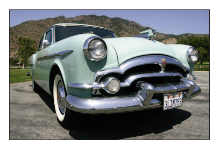
Sequence 24 : Torque lug nuts to manufacturer's specifications. Rotate the wheel and check for any interference. Bed in the brake pads and rotor in a safe location before general use driving.