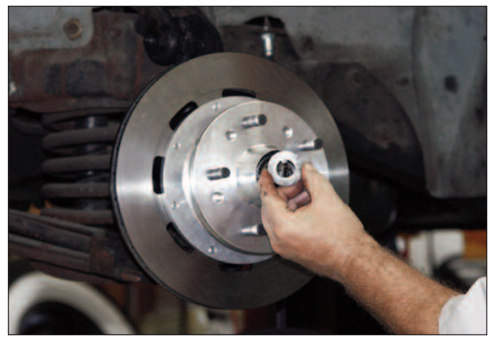
Sequence 15 : Grease the non-threaded portion of the spindle and slide on the Rotor/Hub assembly. Install the indexed spindle washer, and castle nut.