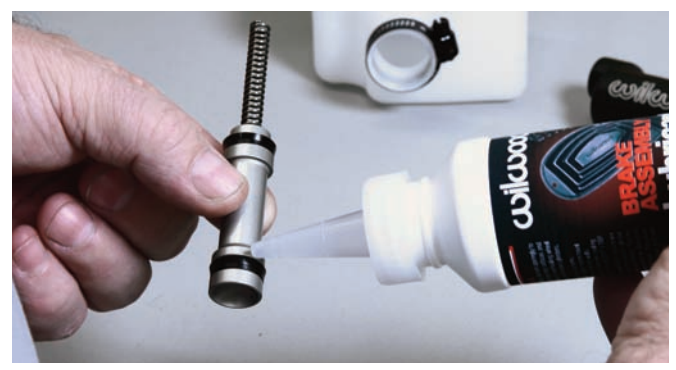
The rubber piston cup seals were coated with lubricant to make it easier to install the piston inside of the master cylinder bore.