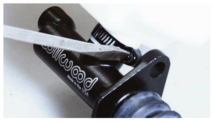
Using a flat blade screwdriver, the hose clamp connection was tightened to insure a good seal.