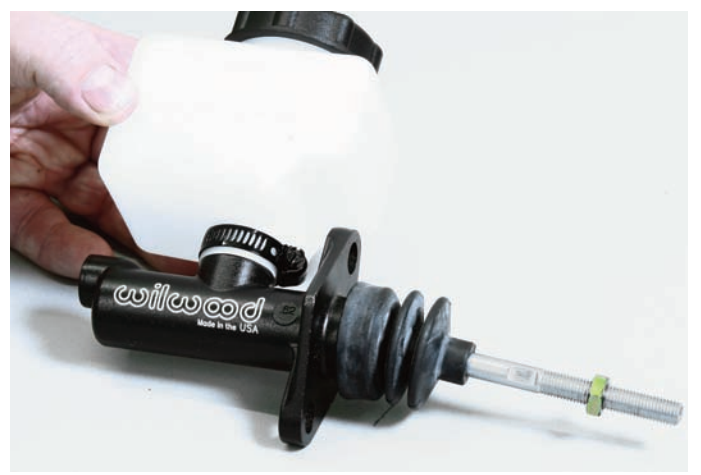
Here is the finished assembly rebuilt and ready to be reinstalled in the car.

If your piston bore is beyond repair and you want to purchase a new master cylinder, the part numbers are as follows: