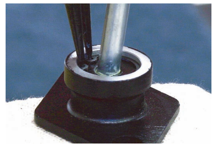
The pushrod was installed into the piston far enough make room for the snap ring to be installed. It is important for the snap ring to sit inside of the groove.