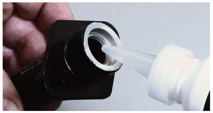
A few drops of Wilwood lubricant was placed inside of the piston bore and then it was distributed evenly inside of the bore. This can be done with finger power.