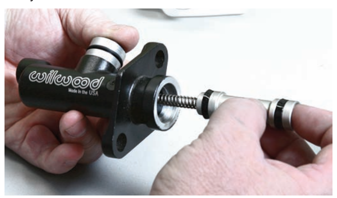
The piston assembly was carefully installed back into the master cylinder bore making sure it slides in easily.