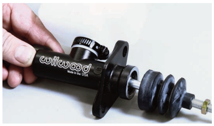
The rubber boot has to be connected to the master cylinder body and the plastic reservoir was installed on the top of the unit making sure the O-ring was used.