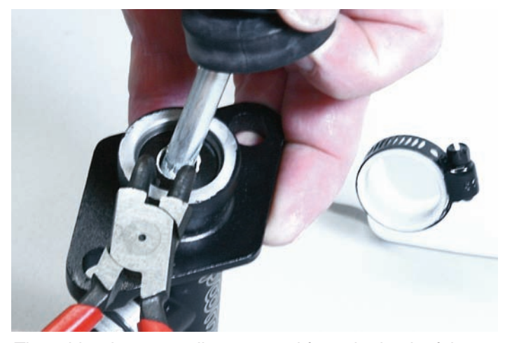
The rubber boot was disconnected from the back of the master cylinder far enough to access the snap ring that holds the piston inside of the bore.

The hose clamp connection was loosened with a screwdriver and then the plastic reservoir was carefully removed from the master cylinder. Notice the O-ring seal that keeps this connection leak free.