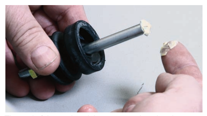
The end of the push rod that rests against the piston assembly was coated with white grease.