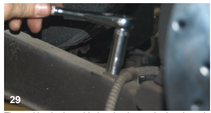
The parking brake cable bracket is attached to the axle strut with a small bolt. Here the bolt is being removed. The small bracket can be used to secure the new cable that will be installed.