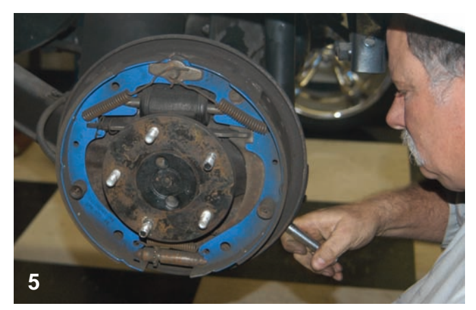
The four nuts and bolts that connect the bearing retainer and backing plate to the axle flange were disconnected. Here the bolts are being loosened with a breaker bar.