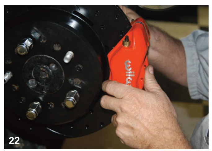
The caliper was placed over the rotor and the connections were aligned with the bracket holes. The bolts were connected finger tight to start with.