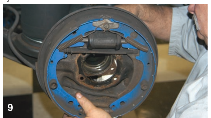
After the connection to the wheel cylinder was disconnected, the backing plate was removed from the axle.