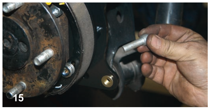
Four of these bolts will be used to install the parking brake mechanism and bearing retainer plate to the axle flange. The bolts are installed from the backside of the axle flange as shown here.