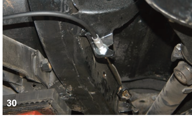
Using a Wilwood universal brake cable kit, a new brake cable mechanism was installed.