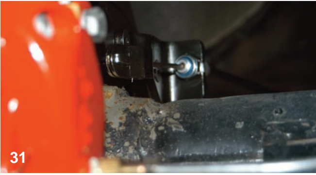
The other end of the universal brake cable hooks to the bracket on the parking brake mechanism and to the arm that activates the system.