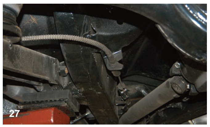
The original emergency brake cable will no longer be used. The cable has to be released and the cable has to be removed from the frame bracket.