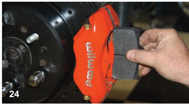
The BP-10 Smart Pads were installed in the calipers as seen here. They drop in from the top, which makes brake pad changes easy.