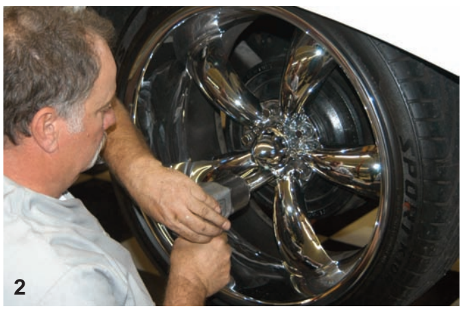
The Chevy was safely elevated so that the wheels and tires could be removed. Using an impact gun and the appropriate size socket, the lug nuts were disconnected from the attractive five-spoke wheels.