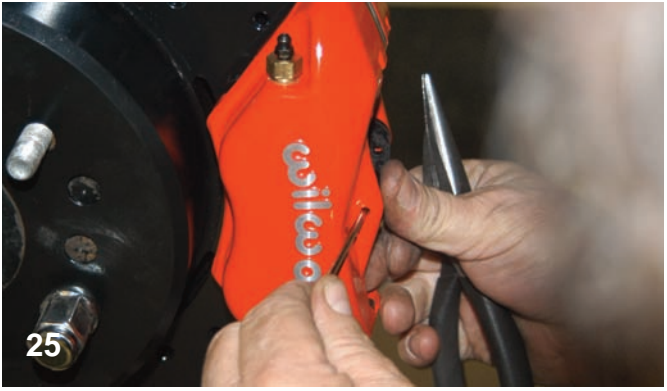
After the pads were in place, the long cotter key was installed to secure them.