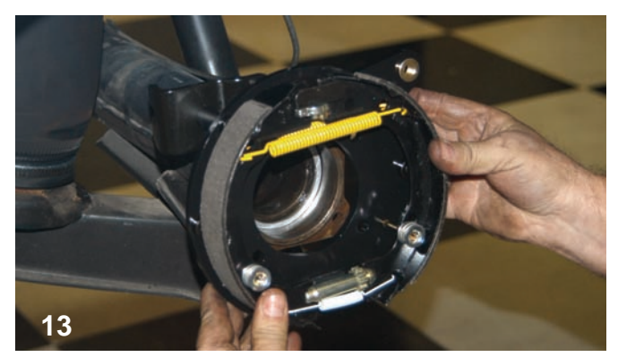
The parking brake mechanism was placed against the axle opening to make sure the boltholes line up properly.