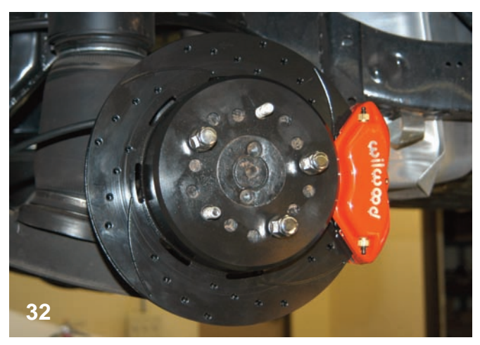
Here is the finished brake assembly ready for action. The Dynapro caliper will work perfectly with the front brake and will provide a good front to rear brake bias. The black rotor face will turn to bare silver metal after a few brake applications are made.