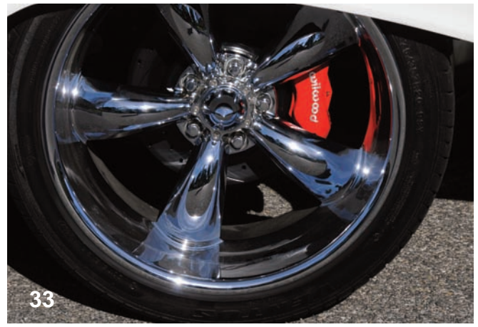
With the new Wilwood brakes installed, the large diameter wheel looks fantastic with the brakes showing through. Like we mentioned earlier, this is a performance improvement and it also improves the car's appearance.