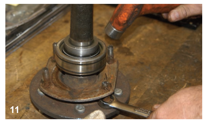
The bolts in the bearing retainer were removed because new bolts will be used for this installation.