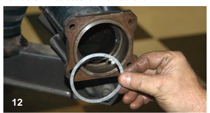
The kit comes with this bearing spacer that fits snugly inside of the axle tube.