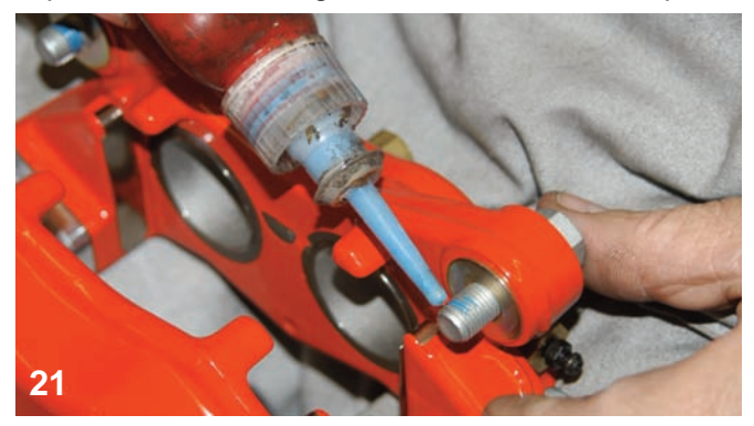
It was determined that only one shim washer was required to center the caliper and rotor. Here the attachment bolt was being coated with Loctite prior to installing the caliper.