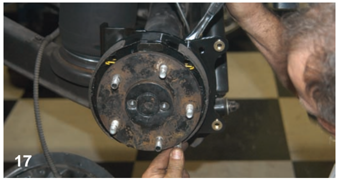
All four bolts were tightened with an open-end wrench on the outside and a socket wrench on the backside. The connection should be very tight, so double-check the connection.