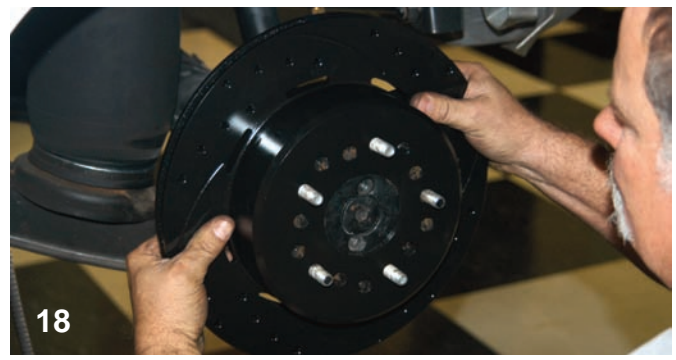
The black E-Coated rotor was placed on the studs and was slid back until the opening in the rotor was firmly against the axle flange centering ring. Notice the additional holes that are used to line up with other lug bolt configurations.