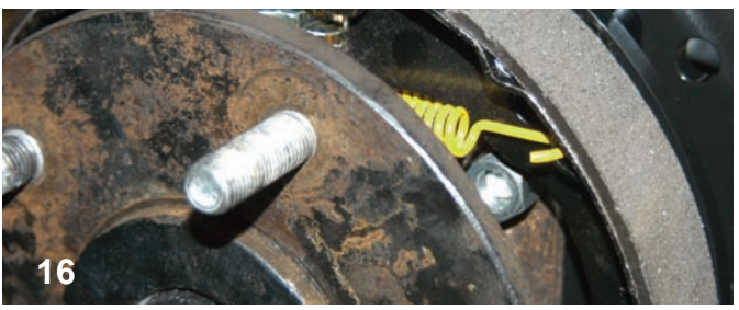
Peeking though the opening, you can see the nut on the bolt. Before the nut was installed, a small flat washer was placed on the bolt. This is a tough area to reach, so you will have to be tricky to get the nut connected to the bolt. Tony used a magnet tool to get the parts started.