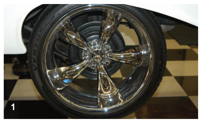
Here is the '61 Chevy with the large 20-inch five spoke rear wheels. The open spokes in the wheels clearly show the little rear drum brakes. In this Chevy's case the brake installation will not only be a performance improvement, it will also be an appearance enhancement.

Before the installation begins, it would be a good idea to spread everything out so you can make sure that all of the parts are included in the kit. Check the