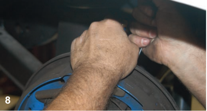
Before the backing plate can be removed from the axle, the brake line has to be disconnected from the wheel cylinder.