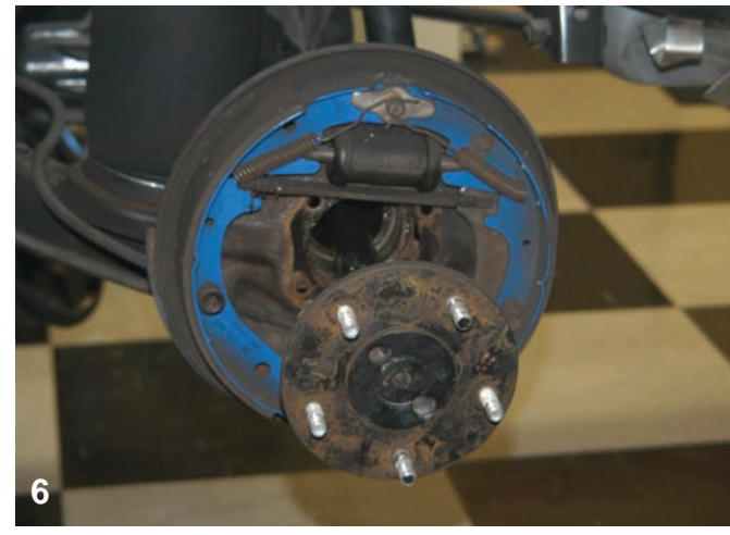
After the four nuts were disconnected, the axle was removed from the differential case. This might require an axle-puller.