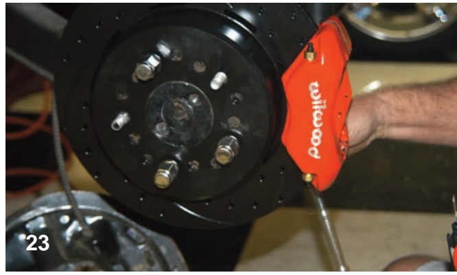
After the caliper mounting bolts were connected finger tight, they were tightened with a socket wrench. After the bolts were tight, the caliper was centered over the rotor.