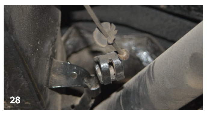
Here is the rear cable after it was disconnected from the main parking brake cable.