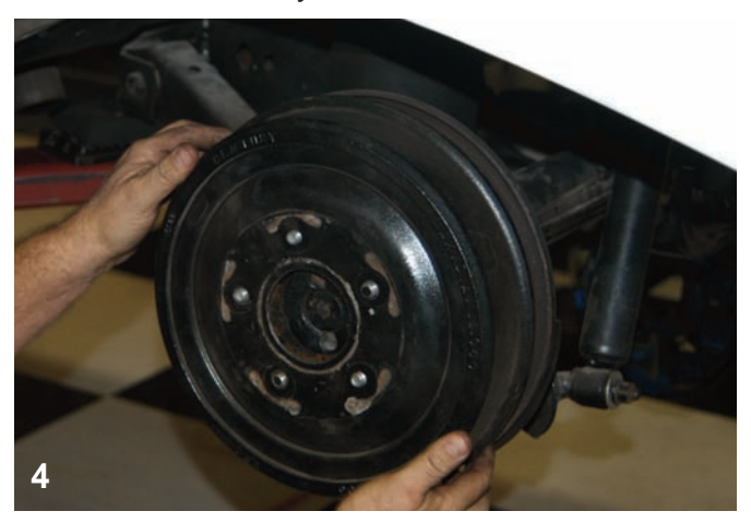
The brake drum was moved side-to-side to release it from the centering ring. After it was loose, it was removed from the car.

items in your kit with the parts list on the instruction sheet. We are going to show you the installation to give you a chance to decide whether you want to install the system on your car or have a professional do it for you.