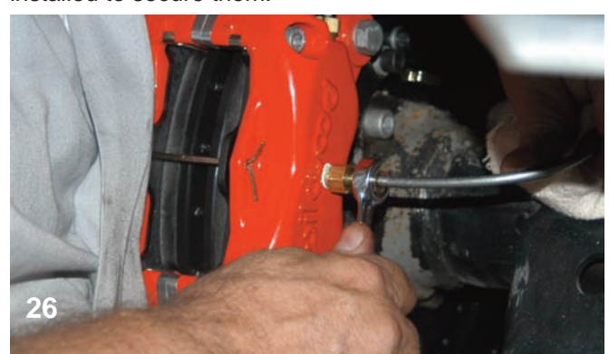
The original rear axle brake line was connected to the fitting in the caliper. Only a small amount of bending was required.