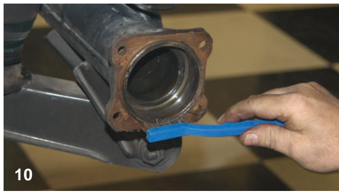
After the backing plate was removed, the axle flange was cleaned with a wire brush. The grease seal in the axle was in good condition so it was retained for this brake installation.