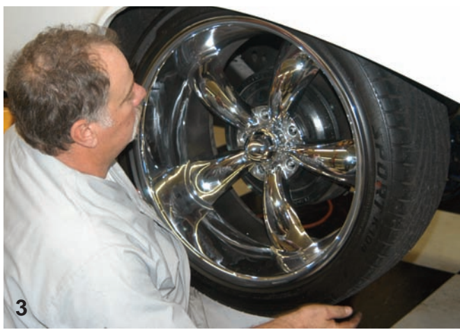
After the lug nuts were disconnected, the wheels and tires were removed from the car.

items in your kit with the parts list on the instruction sheet. We are going to show you the installation to give you a chance to decide whether you want to install the system on your car or have a professional do it for you.