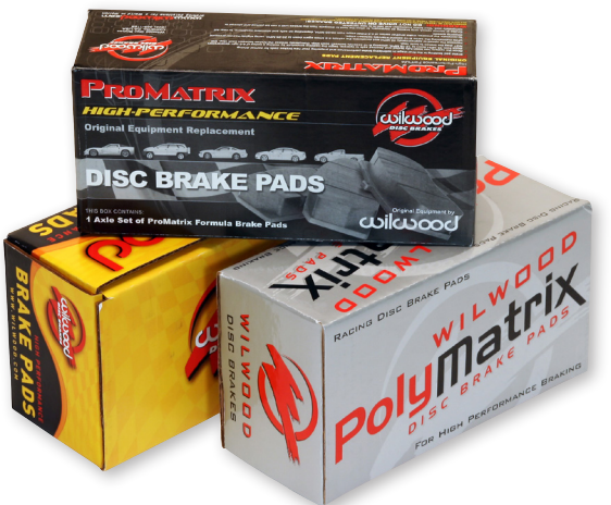
Friction compounds available for all applications, from daily driver to pro racing.

OFFSET CLUTCH/BRAKE ADJUSTABLE RATIO PEDALS