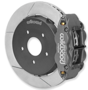
FNSL4R/ST Rear Brake Kit P/N 140-16208 Download a high resolution photo, click here