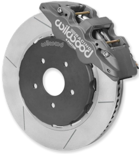
AERO6R/ST Front Brake Kit P/N 140-16202 Download a high resolution photo, click here