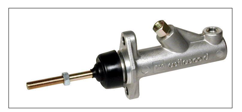
Compact Remote Aluminum Master Cylinder

Compact remote master cylinders are the perfect solution for club sport racers, small open wheel racers, and any other custom application when there is limited mounting space for the master cylinder and fluid reservoir. Three bore sizes, from .625" to .750", are available to accommodate compact brake calipers, short pedal ratios, and hydraulic clutch systems. Both fluid ports are located on the top of the cylinder body for additional end clearance in short mounting spaces. A remote fluid reservoir can be located in an easy access area to simplify maintenance and bleeding procedures. With a full 1.4 inches of stroke, these cylinders provide plenty of volume for a wide variety of custom applications.