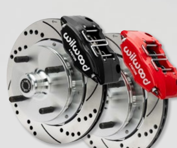
SRP Drilled & Slotted Rotors - Front