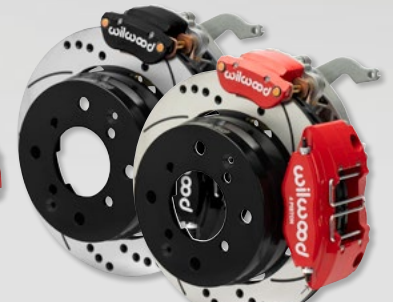
SRP Drilled & Slotted Rotors - Rear with Park Brake

BRAKE KITS ORDERING INFO: PH: 805.388.1188 • FAX: 805.388.4938 • wilwood.com • info@wilwood.com