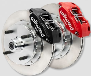
Precision Plain Face Rotors - Front