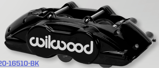
P/N 120-16510-BK Black Powder Coat