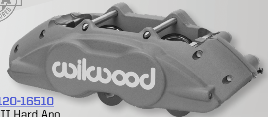
P/N 120-16510 Type III Hard Ano