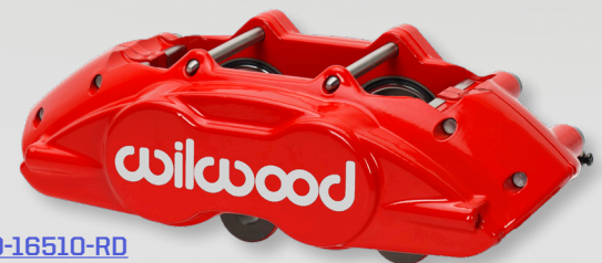
P/N 120-16510-RD Red Powder Coat