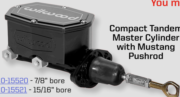
Compact Tandem Master Cylinder with Mustang Pushrod

260-15520 - 7/8" bore 260-15521 - 15/16" bore