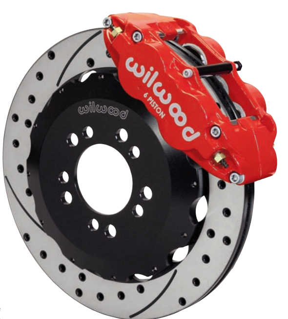
FNSL6R Kit Assembly, 12.88" Shown Download High Resolution Photo, Click Here