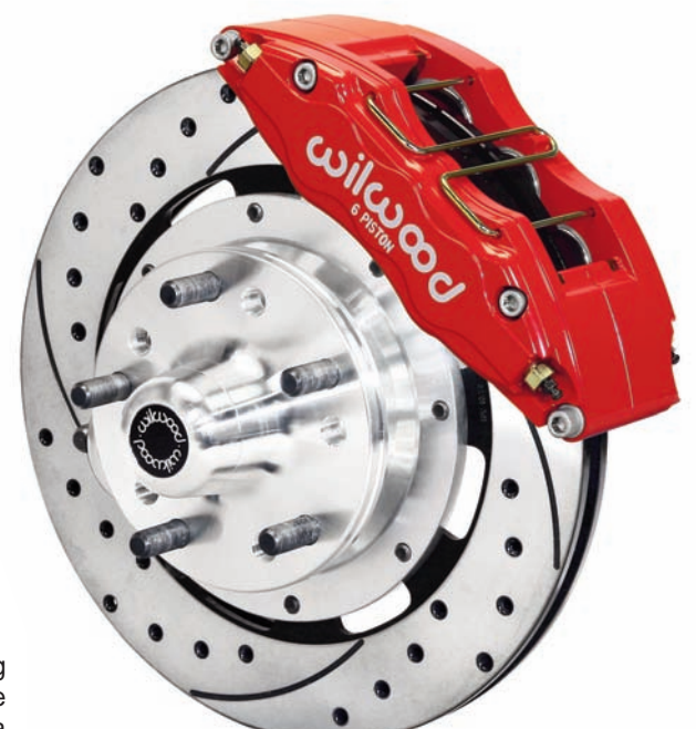
Front Kit with SRP Rotor and Red Caliper Download high resolution photo, click here