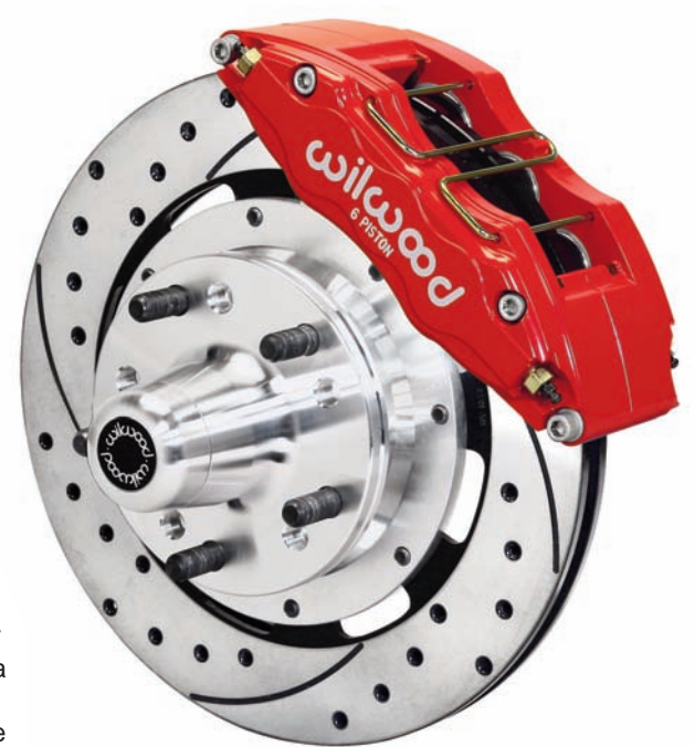
Front Kit with SRP Rotor and Red Caliper Download high resolution photo, click here