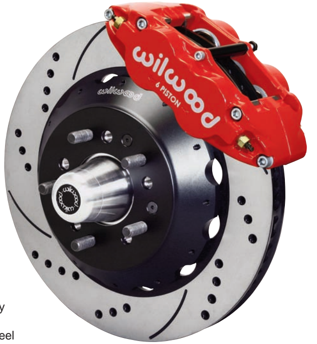
Big Brake Front Kit with SRP Rotor and Red Caliper Download High Resolution Photo, click here