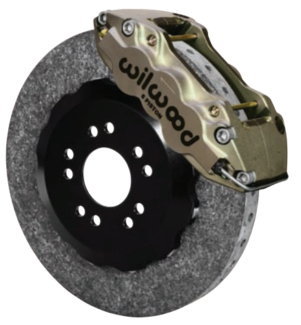
WCCB Big Brake Front Kit For high resolution photo for printing, click here

Clevis and cable kits, which attach to the parking brake assembly are not included in the Wilwood parking brake kit. Wilwood offers a cable kit specifically for this vehicle, order part number 330-11221 for model years 2005-2010 and part number 220-12335 for model years 2011present. Please visit our web site at www.wilwood.com, or call (805) 388-1188 for additional information.